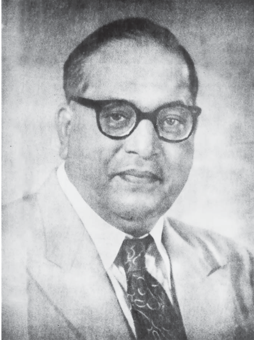
Babasaheb Dr. B.R. Ambedkar (14th April 1891 - 6th December 1956)