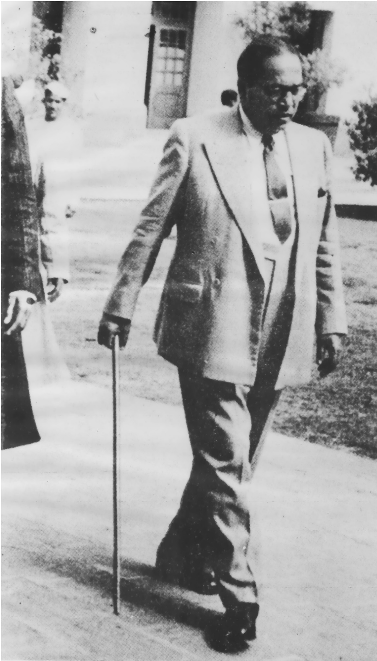
Dr. Ambedkar on the lawns of Parliament