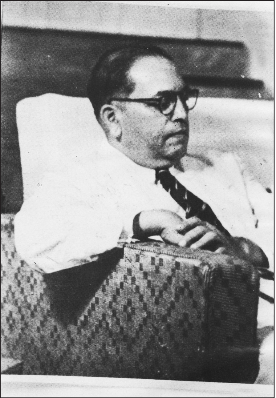
Babasaheb Dr. B.R. Ambedkar (14th April 1891 - 6th December 1956)