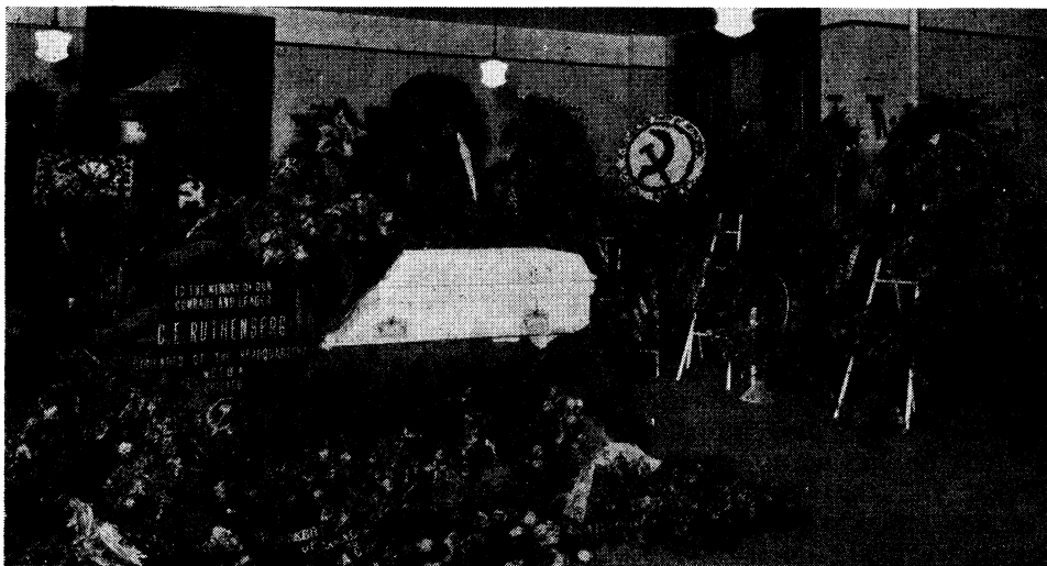
Some of wreaths sent expressing sorrow at Ruthenberg's Death.

Throughout his life Ruthenberg bore himself as a true soldier of the revolution. His name will live in the annals of the American working class along with those of other brave fighters of the labor movement.