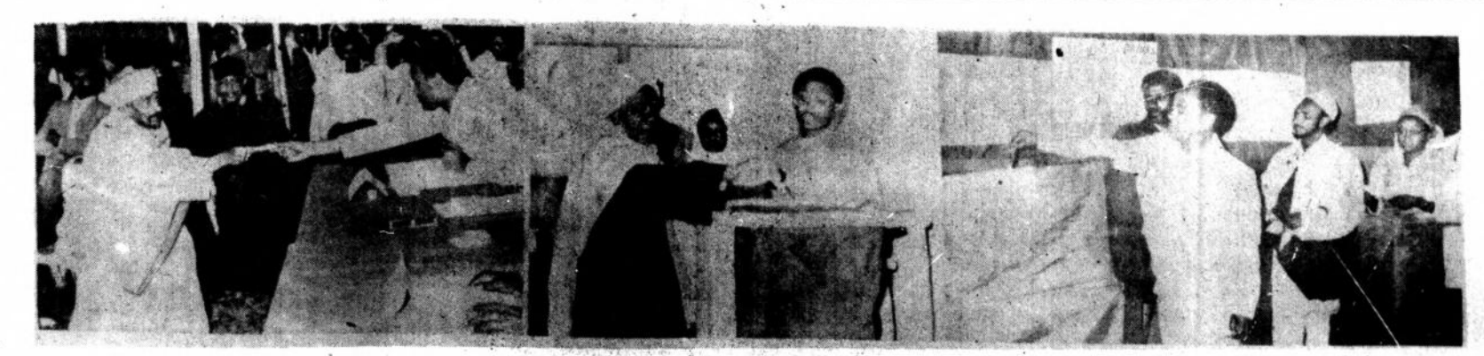
The people endorse the Constitution of the PDRE