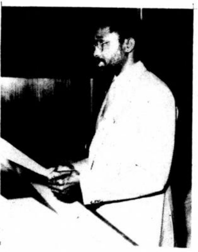
Representative of Liberation movements

They are Mr. Z.T. Onyonka, Foreign Minister of Kenya, Mr. L.B. Monyake, Foreign Minister of Lesotho, Mr .S.J.S. Sibanyoni, Foreign Minister of Swaziland, Mr. B.W. Mkapa, Foreign Minister of Tanzania, Dr. Witness Mangwende, Foreign Minis-