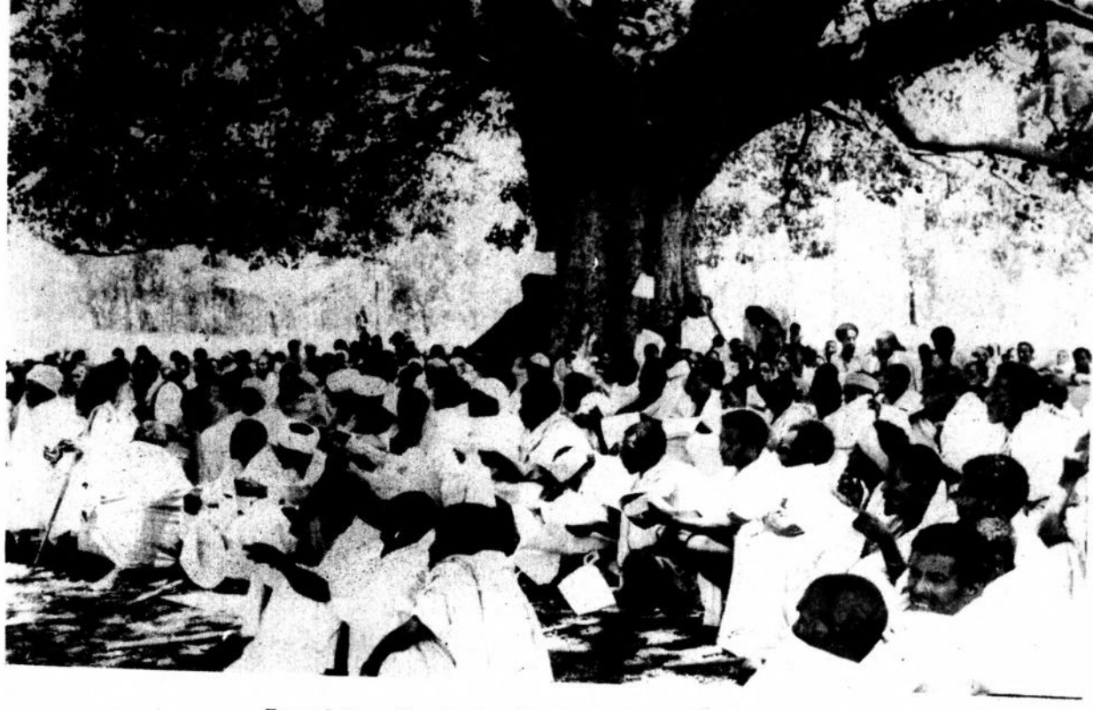
Formulating a Constitution By the People For the People

All such organizational activities involved a herculean effort. The struggles that had to be waged against internal and external enemies and counter-revolutionaries made the accomplishment of constructive tasks all the more demanding. Nevertheless, the determined struggle of the broad masses successfully brought