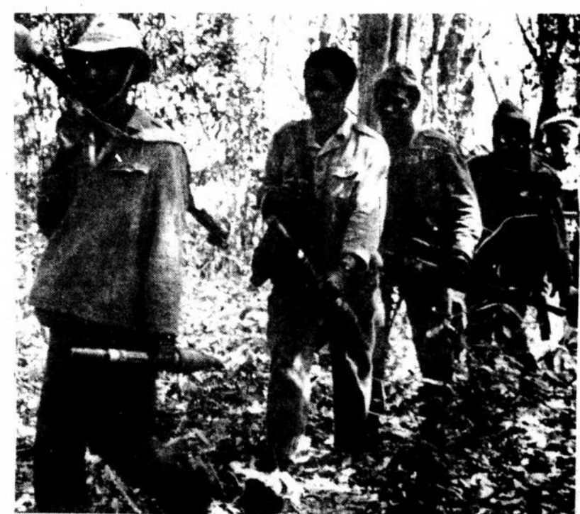
A detachment of PAICC fighters in Guinea-Bissau during the war for national liberation