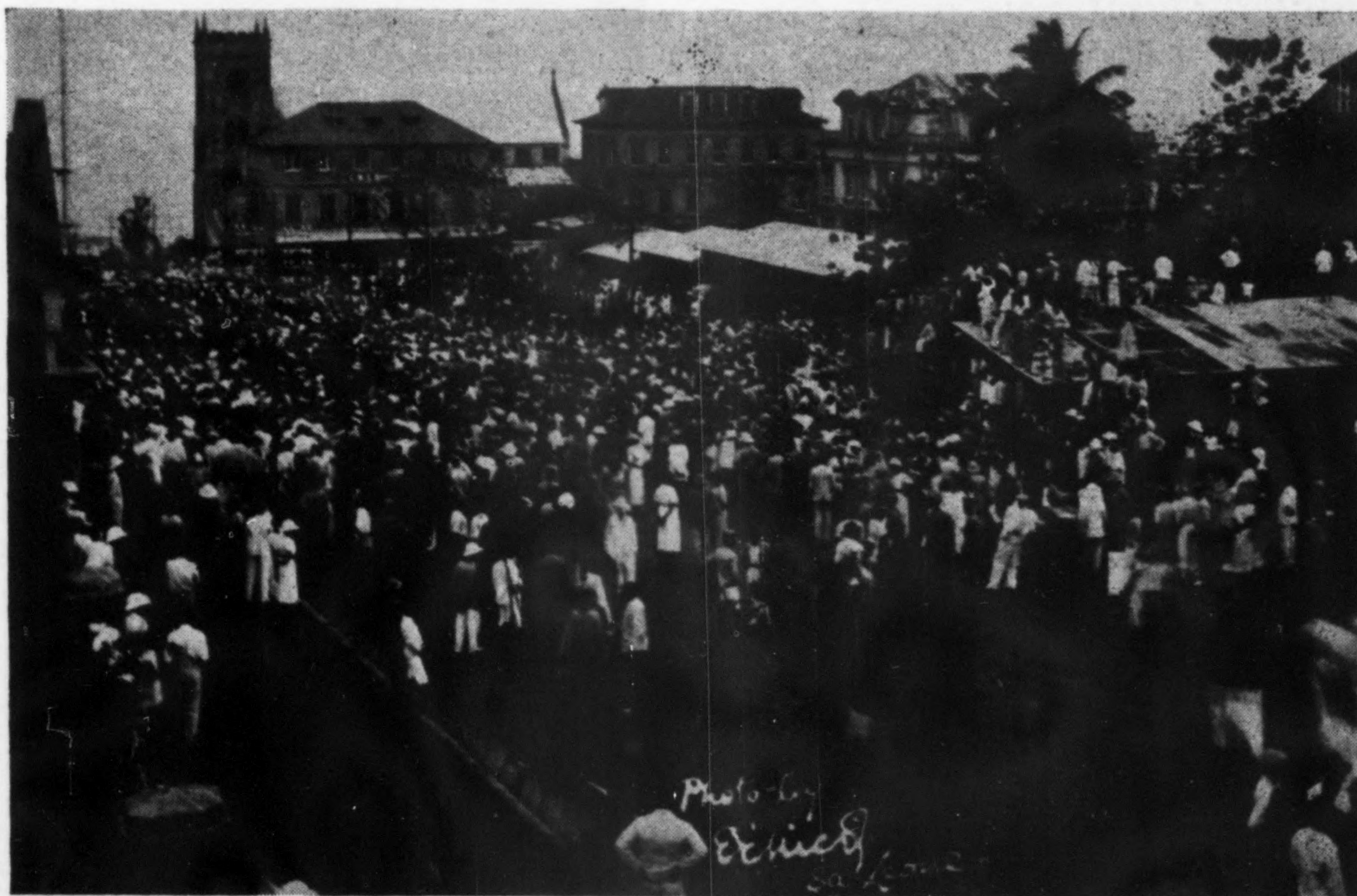
Mass protest demonstration against deportation and sedition ordinances. Freetown, Sierra Leone, West Africa. May 16, 1939