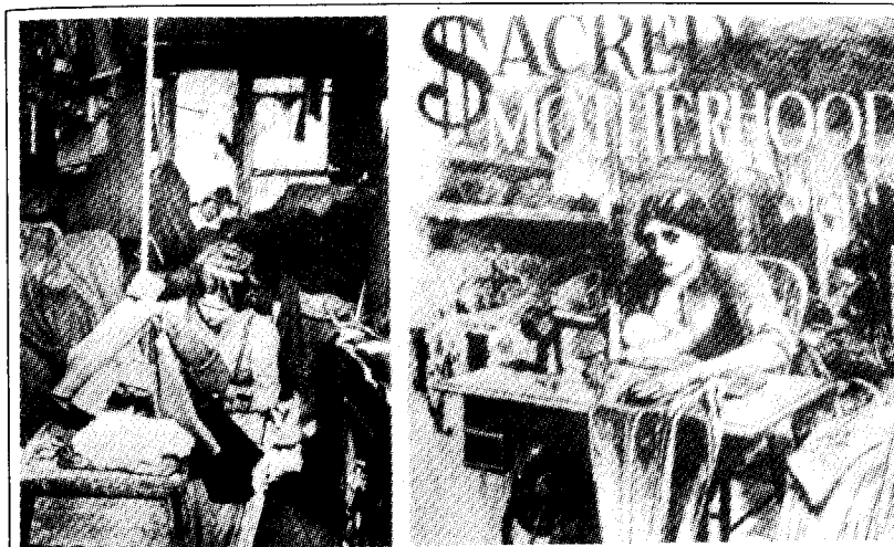
On the left, a typical sweatshop of the early 1900s, little different from the conditions Chinese women emigrant workers must endure today in New York City. On the right, an anti-capitalist poster of that time.