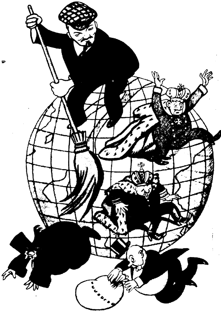
Comrade Lenin Sweeps the Globe Clean (Caption of 1920 Soviet poster)