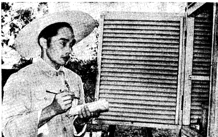
Taking careful note of changes in weather.

interconnections of this sort occurred each 180 days. With this as basis, and considering other relevant factors, we diagrammed the weather pattern for each 180-day period. Thus we achieved our accurate forecasts of heavy rain nine times out of eleven in 1969.