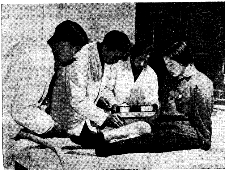
Acupuncture treatment for a girl who broke her back.

waist in the area of the spinal cord. At three cun * he reported a feeling of combined soreness, swelling, heaviness and numbness that was transmitted down the thigh. The muscle of his thigh quivered, and he perspired. The comrade inserting the needle asked whether he shouldn't withdraw the needle, but he said firmly: "Insert deeper!" At four cun he experienced an excellent needling sensation, and a new point had been found in treating trau-