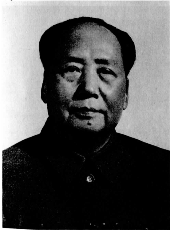
Our great leader Chairman Mao.

Printed in the People's Republic of China