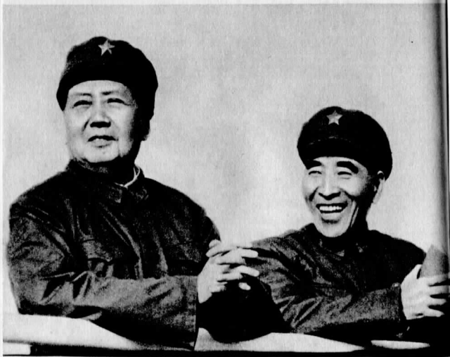
Our great leader Chairman Mao and his close comrade-in-arms Vice-Chairman Lin Biao reviewing the mighty cultural revolutionary fighting forces from the Tien An Men rostrum on November 3, 1966.

T HE current Great Proletarian Cultural Revolution is absolutely necessary and most timely for consolidating the dictatorship of the proletariat, preventing capitalist restoration and building socialism.