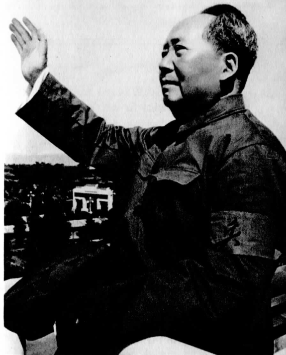
Our great leader Chairman Mao receiving for the first time the Red Guards and other revolutionary masses from all over the country on August 18, 1966, in Peking, centre of the Great Proletarian Cultural Revolution.