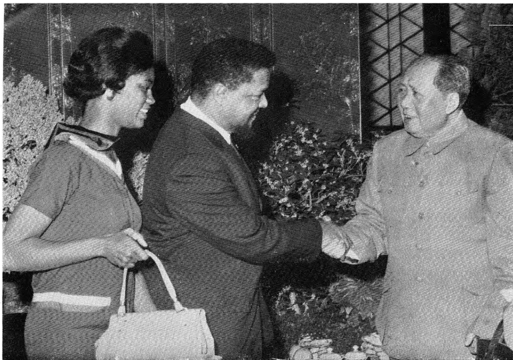
Chairman Mao Tse-tung receives the American Negro leader Mr. Robert Williams and Mrs. Williams (October 1, 1963)

Printed in the People's Republic of China