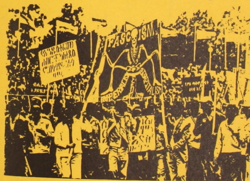
Partial view of The May 1975 Anti-fascist demonstration right in the center of Addis Ababa!!!

secret police requires such a disguise!)