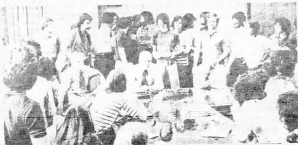
PHOTO ABOVE: 100 students at the University of Florida at Gainesville, including members of the Revolutionary Student Brigade, marched over to the President's office and occupied it for 1 1/2 hours. This action, which followed a rally, protested tuition hikes from $15 to $52 a quarter (Spring 1975)

for profits. Besides setting up the schools to train us to fit in with their profit system as workers or technicians, the schools also serve them by running down lies to us. In school, the history books tell us that the masses of people are just a bunch of sheep, led around by "great leaders". Capitalism always points to these "leaders" as our salvation, and tells us to sit back and let them do the thinking (and it's no coincidence that just about all these leaders are capitalists too!). They put out this crap to confuse us and isolate us ("everybody's out for themselves so look out for number one") and to make us think that capitalism will always be around and we shouldn't even try to do anything about it ("you can't fight city hall"). The capitalists can't provide us with a really decent education-- one that teaches us our real history and helps us figure out our future-- because it isn't in their interests.