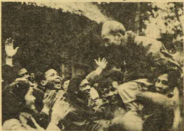
Ho Chi Minh being greeted at a newly liberated village. Ho, leader of the Vietnamese Workers' Party, was a great hero of people all around the world, leading the Vietnamese revolution for over 40 years.

Thieu and his US masters know they are hated and despised for the destruction and plunder they have continued to bring to Vietnam. They stand in desperate fear of the people rising up and throwing them out—so they've continued to violate the Paris Peace accords every step of the way. Many newspapers and rallies in the Saigon zone have been totally banned. Not one election has been held since the Treaty was signed—every village official has been personally appointed by the fascist Thieu. Two hundred thousand political prisoners have still not been released from tiger cage prisons. Countless numbers of land grabbing operations