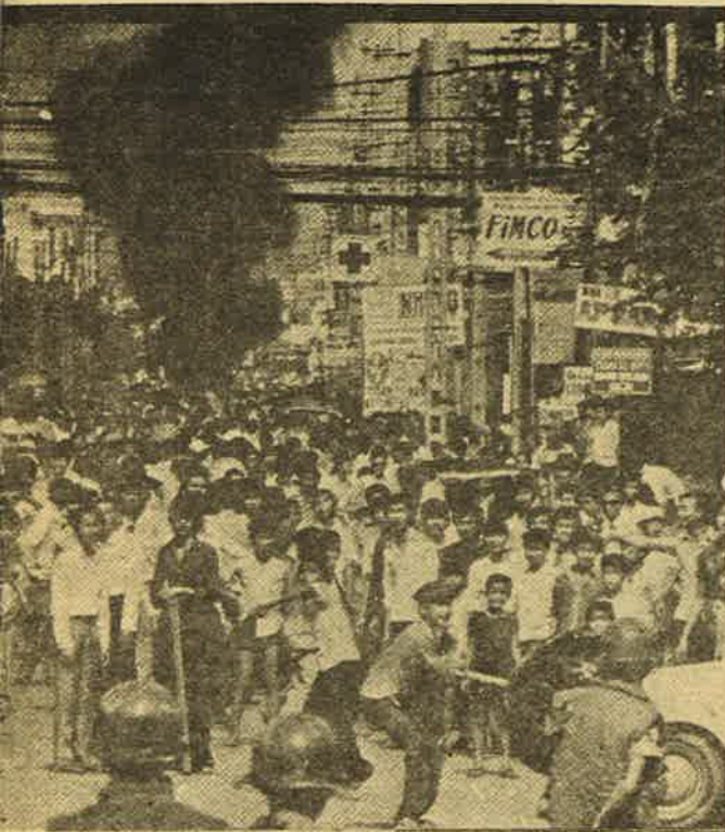
On Oct. 31, 1974 against the Thieu regime, demanding to Saigon from the surrounding areas, waging a face-to-face struggle to suppress them.

forces, the National United Front of Cambodia, have clearly stated their aims of throwing Lon Nol and US imperialism out of Cambodia--a cause and struggle that the great majority of Cambodian people are actively supporting and participating in. As defeat comes closer and closer, the newspaper, the television and radio networks, the mouthpieces of monopoly capitalism, all paint the "horrors" of war and try to put the blame on the people fighting against foreign aggression and plunder. In fact, it was the goddamn US imperialists, their coup, their fascist puppet who has brought pain and suffering to the Cambodian people--as well as a revolutionary movement that's kicking its ass right out of the country.