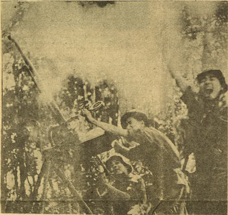
The Vietnamese victories in the present offensive is possibly the final defeat for the US imperialists in their drive to make southern Vietnam a colony for profits and plunder. Above, Vietnamese anti-aircraft crew shoot at US planes. Right, 1973 rally in S.F. demands US sign Peace Treaty and get the hell out of Indochina.