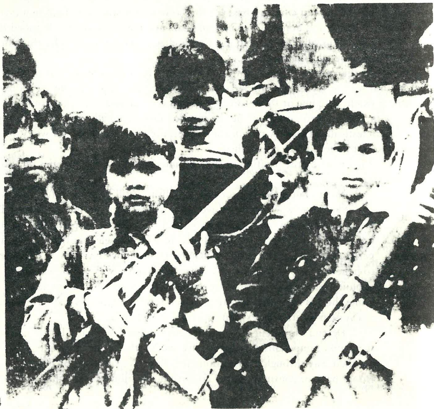
4 Khmer Rouge boy soldiers