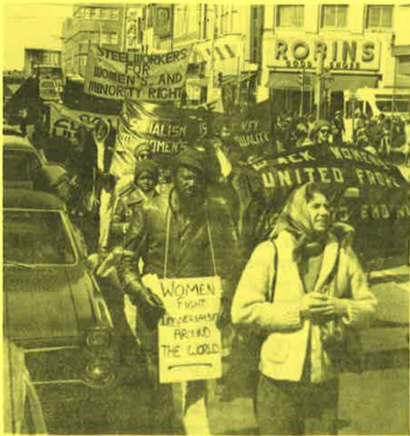
Equality for minorities and women, a key struggle in the fightback.