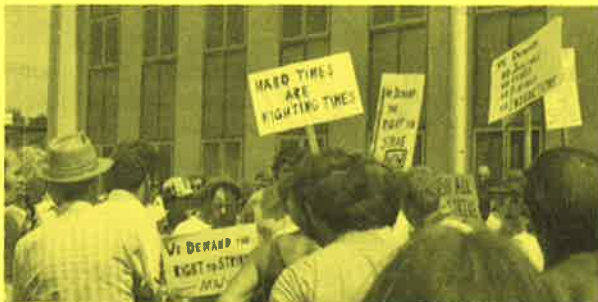
Wildcatting miners demonstrate for the right to strike in West Virginia.

Boston, Mass.: Workers United to Fight Back worked all summer to prepare for the reopening of schools this September, mobilizing people in both the white and Black communities against the racist segregationist movement and in defense of Black people's equal rights. This committee has built several large demonstrations under the banner: "STOP THE SEGREGATIONIST MOVEMENT—BUILD THE FIGHTBACK!" They have stood firm against all attempts to divide minority and white workers.