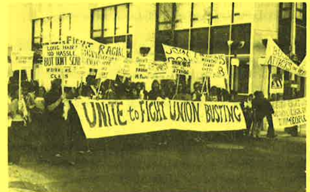
The people of Denver fight union busting attempts.

The American people are not holding back either. 80,000 miners wildcatting against company attacks and labor sell-outs in West Virginia and other states, expressed the sentiments of the majority of working people: "Hard times are fighting times!" "We've had enough!" The heroic stand of the United Farm Workers, continuing to build the union under police and vigilante attacks, and under the assault of the Teamster-Grower conspiracy, continues to be an inspiration with their cry: "Si se puede!—Yes it can be done!"