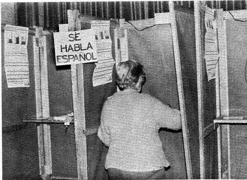
Voting in Los Angeles.

to forbid any law which would “diminish or ignore” the role of English, and give any state resident the right to sue whenever he/she believes the law is not being properly enforced.