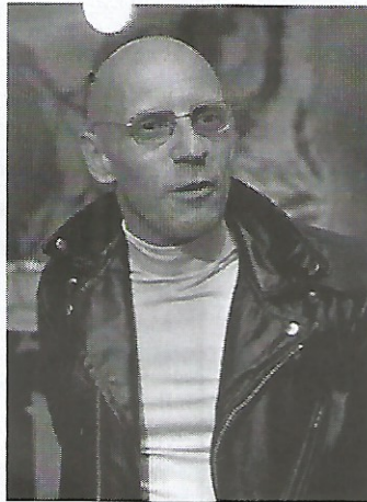
Theorist Michel Foucault

sexual relations between men as assault. Lesbianism was not legally acknowledged, but women's sexual behaviour was policed through legislation such as the Contagious Diseases Act, which restricted women's ability to roam the streets.