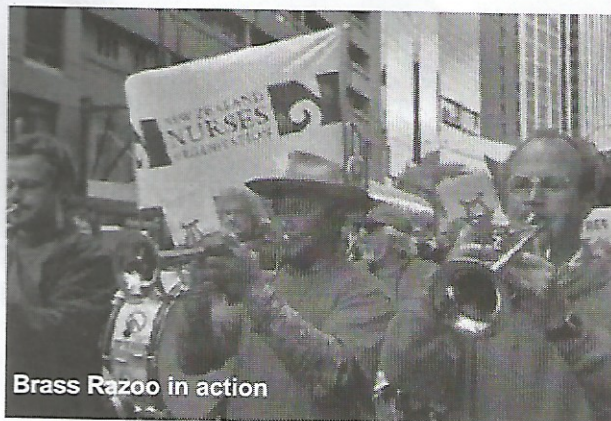
Brass Razoo in action

DF: No-one's kept count, but it would be more than a