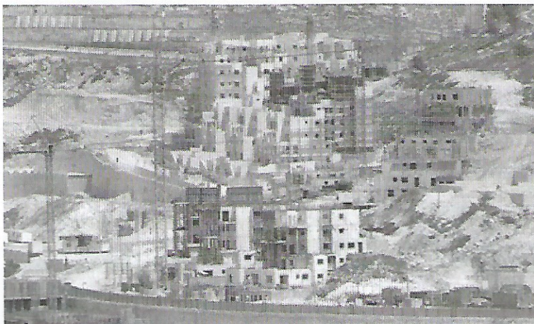
Israeli settlement under construction in East Jerusalem, West Bank.

Why this aggression against the indigenous population of Palestine? The answer to this question lies in what Zionists are attempting to do in Palestine which was summarised by David Ben-Gurion, the first Prime Minister of the Israeli state, in the introduction to The History of the Haganah . He wrote: