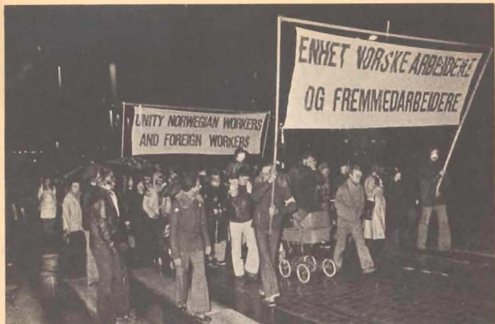
Fra fremmedarbeiderforeningas demonstrasjon mot rasisme og diskriminering 5. oktober ifjor.