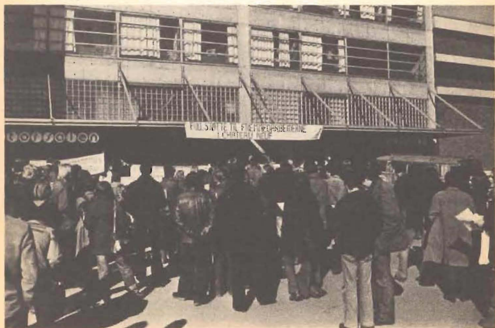
Demonstrasjon til støtte for fremmedarbeiderne i Chateau Neuf i mars 1977.