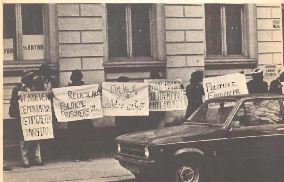
Fremmedarbeidere demonstrerer utafor den pakistanske ambassaden i Oslo.