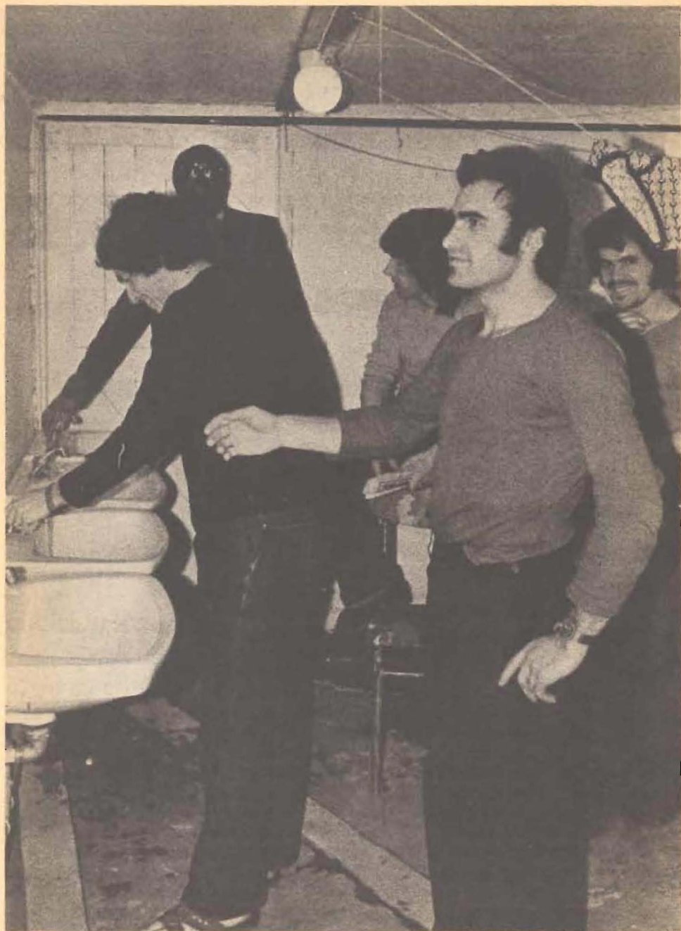
Boligforholdene for de fleste fremmedarbejderne er elendige, her fra hybelhuset til «Jøtularbejderne».