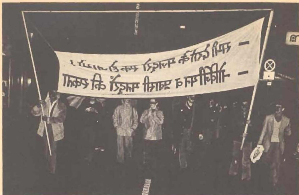
En seksjon fra fremmedarbeiderforeningas demonstrasjon 5. oktober.