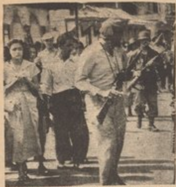
TRIUNFO EFIMERO: En Jayuya, un pueblo de la montaña, los revolucionarios nacionalistas obtuvieron un triunfo efimero cuando lograron apoderarse del pueblo, luego de atacar el cuartel de la Policía e incendiar otros edificios públicos y privados. Fuerzas de la Guardia Nacional recobraron el poder al día siguiente, y devolvieron la tranquilidad a la ciudadanía.

Cuando miembros de los YOUNG LORDS van a Puerto Rico siempre hablamos con aquellos patriotas del Partido Nacionalista que años atrás levantaron las armas contra el invasor norteamericano yanqui. Visitamos sus casas, oímos las historias de sus movimientos y aprendimos de ellos. Así fue que pudimos