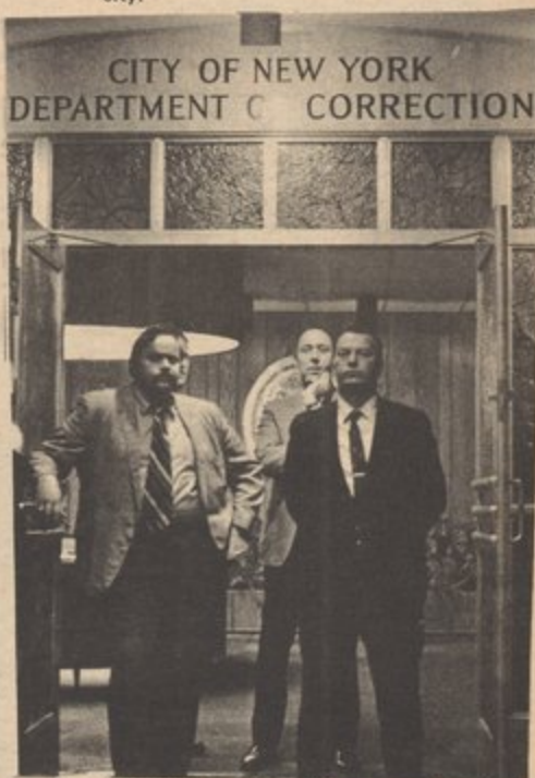
"GREETING COMM. FOR CLERGY"

Lindsay has said that the armed takeover of the People's Church is "deplorable and a sacrilege." We say that the true sacrilege is the treatment of prisoners in the jails because they have been denied access to the clergy. We say that it's deplorable that no one has kicked your two asses and run you out of the city.