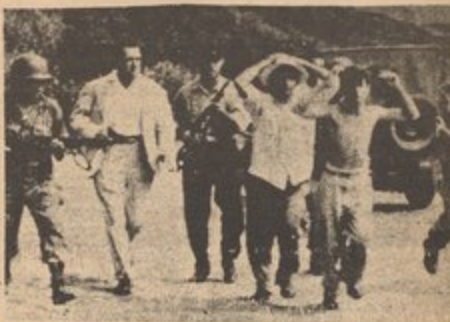
Soldados, policías y otros agentes represivos conducen prisioneros a dos campesinos durante la revuelta nacionalista de 1950, ocasión en que en la población Jayuya se proclamó la independencia de Puerto Rico.

October 30th marks the twentieth anniversary of the revolt of Jayuya. On that day, the armed forces of the Nationalist Party led an uprising in Lares, Utuado, Ponce, San Juan, Arecibo, and other towns. Very few people know the real story of the revolt. Amerikkkan history books of Puerto Rico hardly mention it.