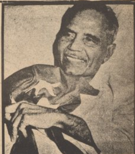
Pedro Albizu Campos, el esforzado líder nacionalista abraza la bandera puertorriqueña que le obsequiaron jóvenes del MPL, mientras el apóstol puertorriqueño se encontraba recluido en un hospital.