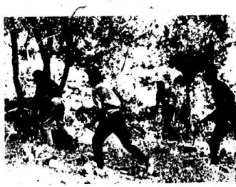
The Palestinian people have come to understand more and more deeply the great truth elucidated by Chairman Mao: "The people's power grows out of the barrel of a gun" and are persistently following the road of armed struggle. Photo: The heroic Palestinian guerrilla fighters.

military installations. The Palestinian commandos completely wiped out an Israeli foot patrol in the Gaza Strip. At seven a.m. on August 8, several "Al Assifa" commando units attacked with rockets and other weapons two enemy vehicle concentrations in Ashdot Yaakov and El Zehava areas in north Jordan Valley. Many enemy vehicles were set on fire and many enemy troops were killed or wounded. Meanwhile the joint forces of "Al Assifa", "Al Saeka" and the popular front for the liberation of Palestine heavily shelled enemy vehicle and tank concentrations on Golan Heights, killing many of them on fire. Enemy reinforcements were ambushed and completely annihilated.