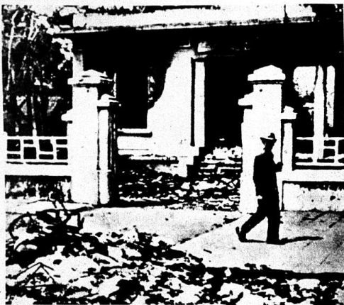
People of Kompong Cham Province demonstrating in support of Head of State Samdech Norodom Sihanouk, angrily burned and destroyed the headquarters of the provincial government under the Lon Nol-Sirik Matak Rightist clique of U.S. lackeys who staged the coup d'etat. (left)