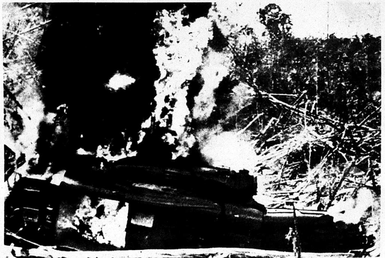
Wreckage of a helicopter of the U.S. imperialists shot down within the territory of Cambodia. In most provinces, the Cambodian patriotic armed forces have won one victory after another in their repeated attacks on the enemy. (above)