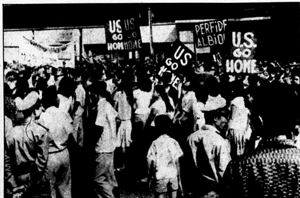
The Cambodian people have opposed U.S. imperialism for a long time. Alongside-- a demonstration of 300,000 of the broad masses in Phnom Penh in 1963, protesting against U.S. imperialist aggression in Asia.