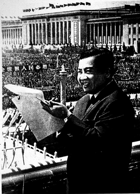
Samdech Norodom Sihanouk, Head of State of Cambodia and Chairman of the National United Front of Kampuchea, addressing a grand rally of the people of Peking in support of the struggle of the world's people against U.S. imperialism held in Tien An Men Square on May 21, 1970. He spoke in firm support of Chairman Mao's May 20th solemn statement: "PEOPLE OF THE WORLD, UNITE AND DEFEAT THE U.S. AGGRESSORS AND ALL THEIR RUNNING DOGS!"