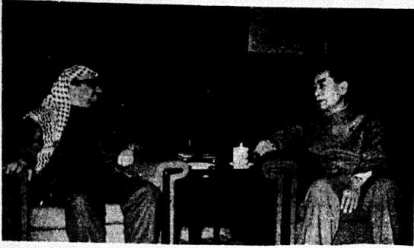
Chou En-Lai confers with Yasser Arafat in Peking, expressing warm solidarity with the Palestinian guerrillas.