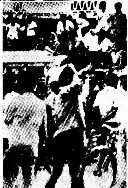
Demonstrators in Cambodia's Kompong Cham province oppose the Lon Nol-Sirik Matak reactionary junta.