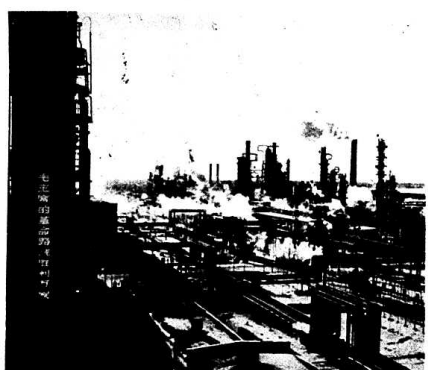
A modern all industry built in the spirit of self-reliance meets China's requirements in both quantity and variety.

During the Great Proletarian Cultural Revolution, the counter-revolutionary revisionist line of the renegade, hidden traitor and scab Liu Shao-chi has been shattered. Mao Tsetung Thought has been widely disseminated and put