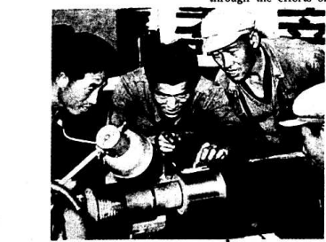
A Teaching Oilfield worker-engineer-leader group, having made a world standard "Christmas tree" valve, discuss how to improve it.