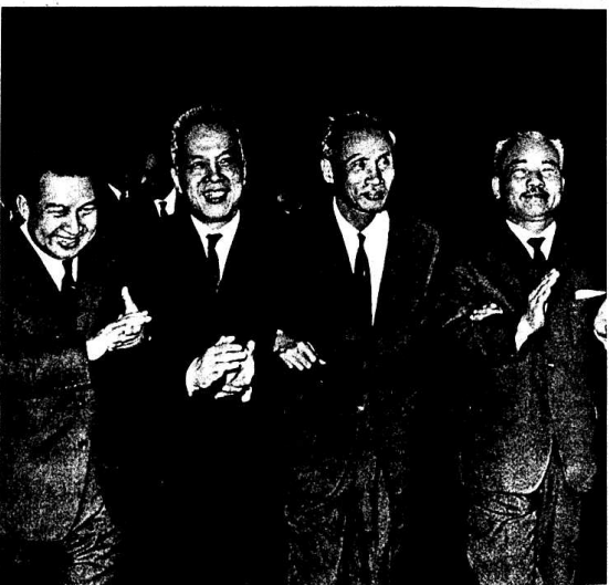
Samdeh Norodom Sihanouk (first left), Prince Souphanouvong (fourth from left), President Nguyen Huu Tho (second from left) and Premier Pham Van Dong (third from left).

In conclusion, the editorial said: The people's liberation armed forces will always advance under the glorious banner of President Ho Chi Minh and the victorious banner of the August Revolution, we are determined to fight to the end, to realize at all costs the ideal of our nation, that is, to "build a peaceful, unified, independent, democratic and prosperous Viet Nam."