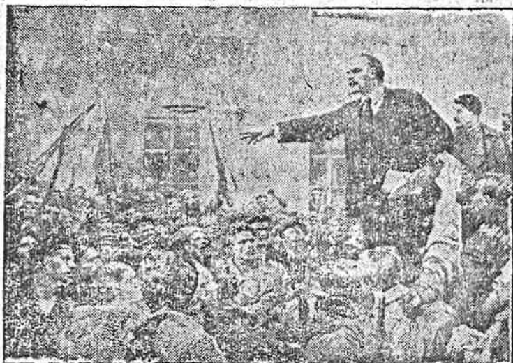
ABOVE: September, 1965 saw the formation of the Communist Party U.S.A. (Marxist-Leninist), based firmly on the principles of Marxism-Leninism. Here, Lenin addresses Russian workers during the 1917 Revolution.