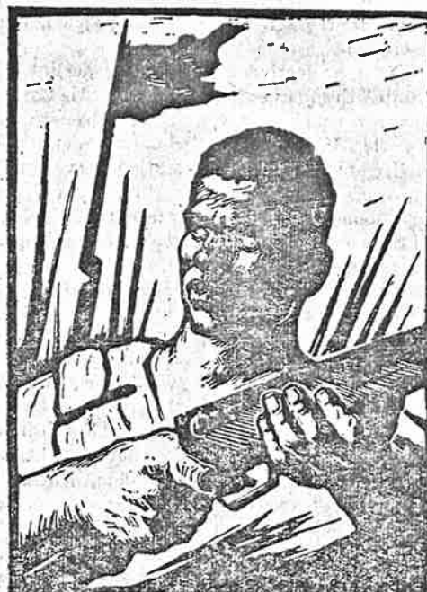
Awakened Woodcut by Wu Pinan