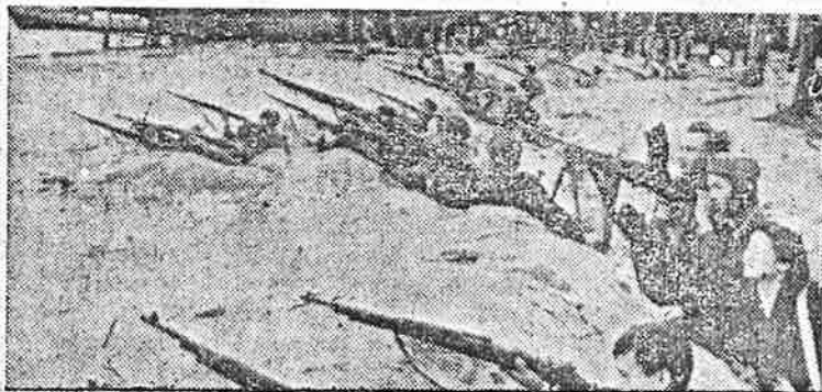
ABOVE: vietnamese people fire at U.S. air bombers. 1965 saw the Liberation forces move significantly closer to victory over U.S. imperialism in Vietnam.