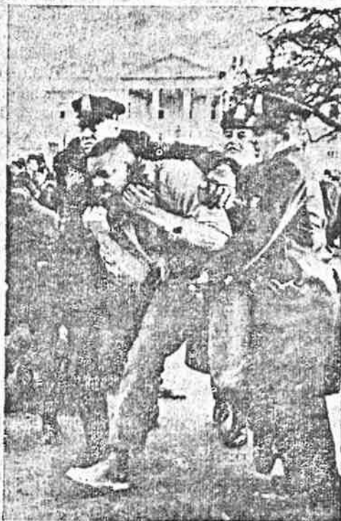
Most Americans enjoy a good life — Lyndon B. Johnson's State of the Union Message, January 4