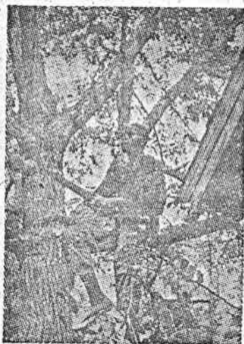
ABOVE RIGHT: C.P.U.S.A. (M-L.) promotes the formation of people's self-defense units to counter the reactionary force of the ruling class with the revolutionary force of the people.