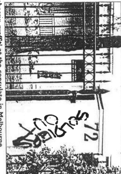
Acts of anger: Unionists burn a Bali T-shirt at Tullamarine yesterday, left; a burnt car at Indonesia's Perth embassy; graffiti at the consulate in Melbourne.