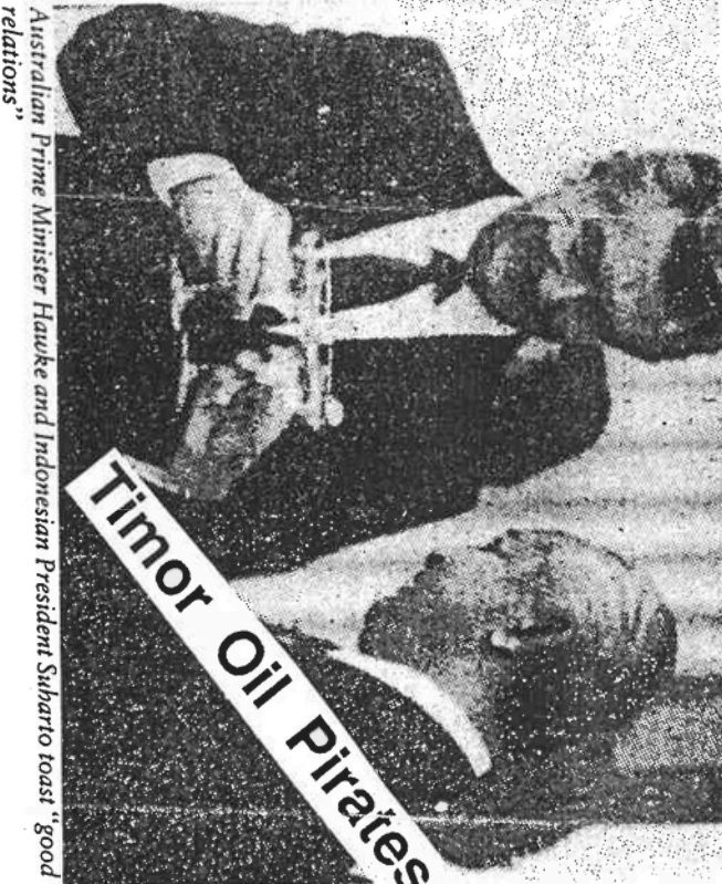
Australian Prime Minister Hawke and Indonesian President Suharto toast "good relations"

between Australian and Indonesia. The ACTU and Trades Hall yesterday voted to use work bans and boycotts to hurt Indonesian firms. The bans are targeting telecommunications and postal services, and will include the withdrawal of non-emergency services to Indonesian offices in Australia. The Maritime Union of Australia said all Indonesian ships and ships carrying goods from the country would be blacklisted. The Australia-East Timor Association wants Australians to help make the campaign effective by boycotting all Indonesian products. The association in Melbourne, more than 600 protesters marched on a meeting of federal Cabinet, while in Sydney demonstrators converged on the office of the Prime Minister. The most hostile protest was in Darwin, where rock-throwing protesters attacked the Indonesian consulate, before pulling down the Indonesian flag and setting fire to it.