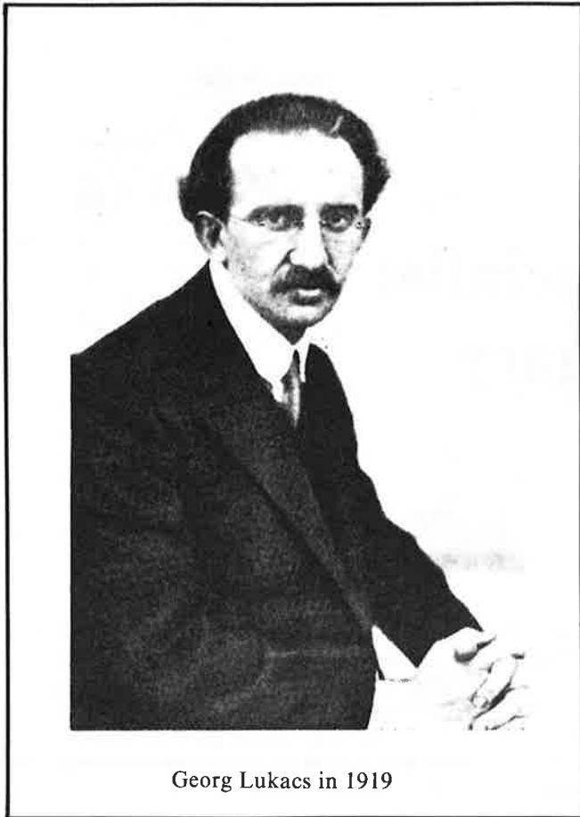
Georg Lukacs in 1919

The circumstances of the post World War II revolutions and of the socialist construction initiated after their victory differed considerably from those amidst which the Great October Socialist Revolution had taken place and the building of socialism had begun in the Soviet Union. Though certain essential features of the October Revolution and of the building of socialism in the Soviet Union also prevailed in the development of the socialist revolutions following World War II, this development had special characteristics. One of the most important of these characteristics was expressed precisely in the development of the relationship between the different classes. The new international balance of power and the interdependence of the struggle for democracy and for socialism made it possible and necessary for the parties to shape their policies of alliances in a new way and in conformity with the new situation, so that the working class would advance on the basis of a broader unity of the social forces. In this new situation, in its struggle for political power and, subsequently, for socialism, the working class could also win over social forces which at the time had not supported the working class in Russia. All of this obviously influenced the forms and methods of the class struggle as well.