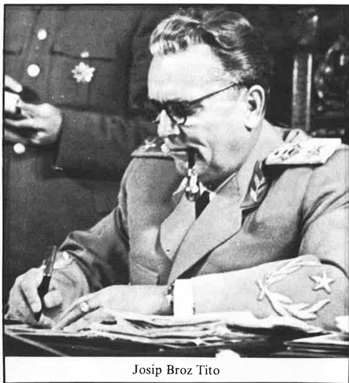
Josip Broz Tito

It becomes clear, even from this brief outline of the policy of alliances, that as a result of the dogmatic conceptions and sectarian practice that had been established in the atmosphere of the personality cult, Rakosi's group did not simply err in individual questions but distorted the Party's policy as a whole. They did not take into account the particular possibilities and requirements inherent in the