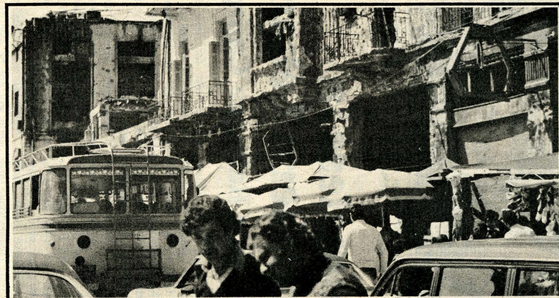
The long fighting in Lebanon has left its scars on the face of the cities and countryside. The capital city of Beirut has been damaged in the continuing civil war. Commercial buildings and private homes alike were demolished when the Zionists shelled the coastal city of Tyre during the most recent invasion.

Tyre, Rashidieh Camp, Al-Bass Camp and Burj Al-Shamali Camp, as Israeli infantry advanced on Tyre.