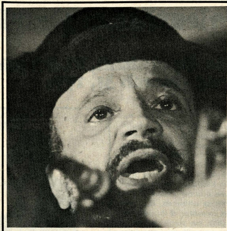
Yasser Arafat, Chairman of the PLO, speaking at a rally in Lebanon on Land Day, which marks the anniversary of Palestinian resistance to land confiscation inside Israel.

PLO: No, they are not so small or isolated. They are supported by the U.S. They are not alone. And the U.S. is one of the biggest powers in the world. The Arab countries are divided, they are backward. They don't have the same capabilities and potentials; they don't have the high techniques and so on. We have to recognize this fact. But in the long run,