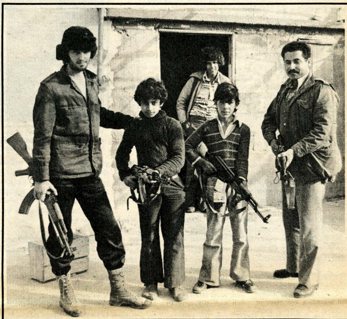
The whole Palestinian people support the struggle for their homeland, regardless of age, sex or religion. These boys aid the Joint Forces in the defense of Palestinian rights.

PLO: The F-15s, the Phantoms, the Skyhawks - all those weapons, the missiles, the tanks, are U.S.-made weapons. If you give somebody weapons, it's not for peace reasons. And the Israelis are using those weapons to kill our people. If they have weapons they will never settle peace. That means