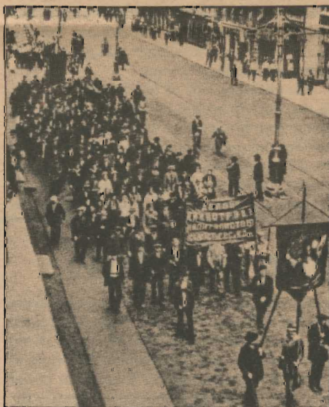
"All power to the Soviets!" "Down with war!" — these were the slogans of the workers at the demonstration which took place on June 18, 1917 in Petrograd.

Today, 65 years later, the questions of war and peace still press on people's minds. As the drums of war beat louder and louder, the American working people, along with their class brothers and sisters the world over, are