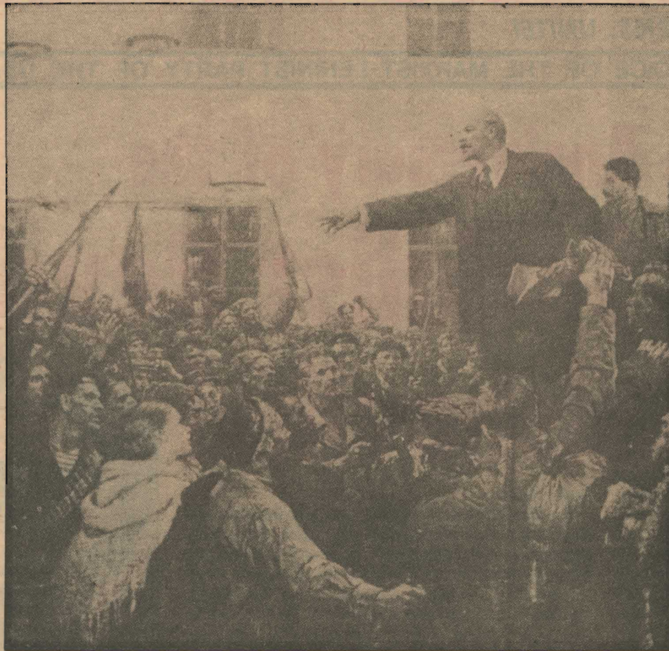
Lenin speaking at the Second Congress of the Soviets of Workers' and Soldiers' Deputies. This Congress, convened on November 7, 1917, the evening of the Petrograd uprising, proclaimed that all power had passed into the hands of the Soviets and formed the first Soviet government headed by Lenin.

working class the world over must prepare itself to achieve the revolution. It proved in practice the correctness of the Leninist strategy and tactics for the socialist revolution of the working class. Look at some of the important lessons from the revolution: