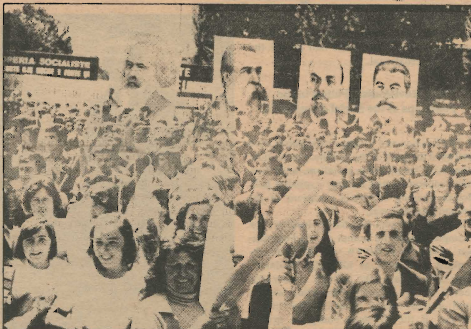
In Albania May 1st is a big holiday. The Albanian working people hold aloft the path of socialist revolution according to the ideas of Marx, Engels, Lenin and Stalin.

Just look at the economic side of things. Today, throughout the capitalist-revisionist world, unemployment, hunger and despair are stalking the working people. The strongest and richest imperialist countries, the U.S., the Soviet Union, West Germany, etc., are in the depths of economic crisis. Their industries have stagnated and are going backwards. In many of the weaker countries the crisis has become catastrophic; the burden of the debts to the imperialist bankers