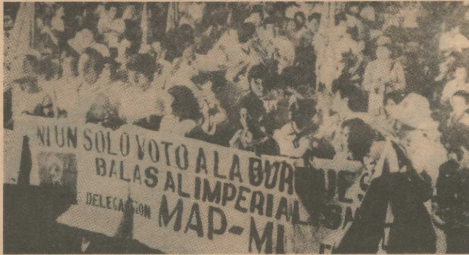
"NOT A SINGLE VOTE FOR THE BOURGEOISIE! BULLETS FOR IMPERIALISM!" — a slogan of MAP/ML in last November's elections.

Such crying contradictions of the Sandinista policy have planted seeds of discontent among the working people. Last