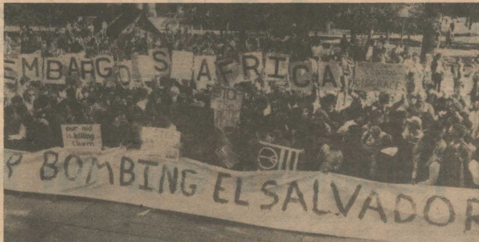
5,000 students at the University of Michigan (Ann Arbor) shout down Vice-President Bush in protest of U.S. aggression in Central America, October 7. Placards read "Embargo South Africa, Not Nicaragua!"

The anti-imperialist activists must break with both the Democratic and Republican Parties. In order not to embarrass the Democrats, the reformist leaders have toned down or eliminated altogether one demonstration after another. Instead they have told the movement to write letters to Congress, to vote for Mr. "Quarantine Nicaragua" Mondale (the so-called "peace vote" in