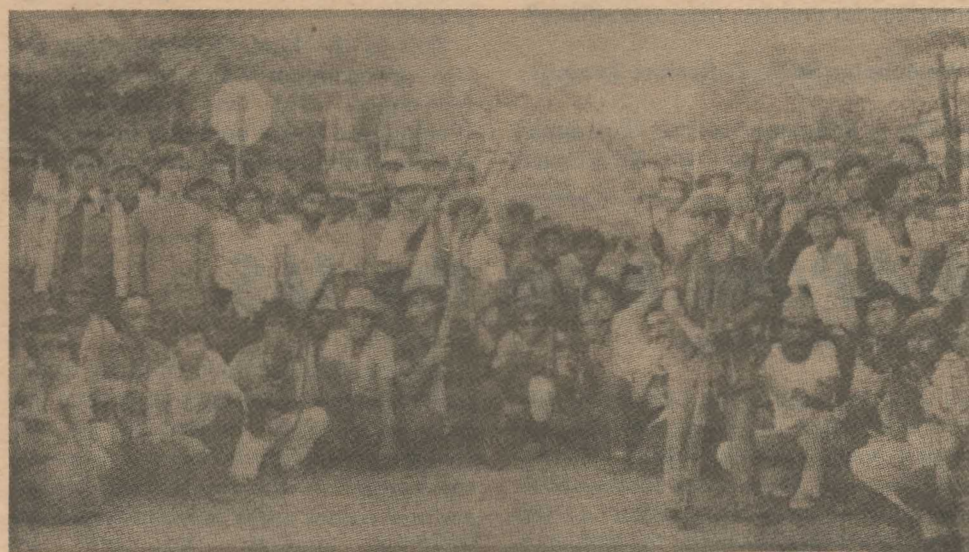
A column of the Popular Anti-Somoza Militias that took part in the liberation of Managua, July 1979.

After the victory over Somoza, MAP/ML and FO plunged into the wave of strikes and land seizures and the workers control move-