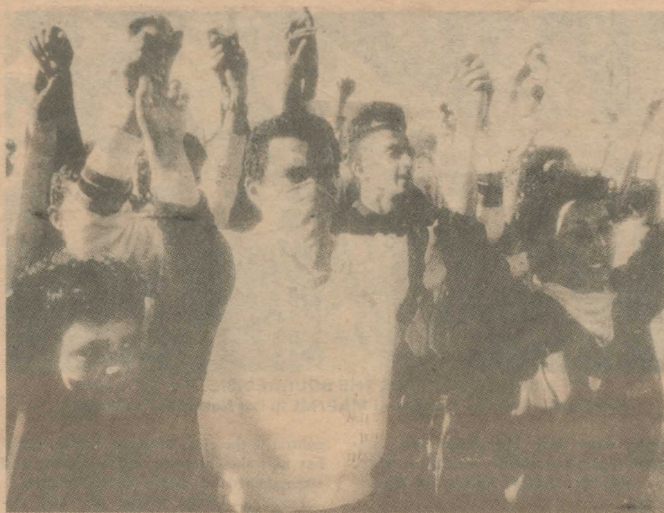
Anti-apartheid demonstrators defy South African military police in the Athlone neighborhood of Cape Town, October 26.

The racist leaders will simply not give up apartheid peacefully. The white capitalists have made too many dollars from the exploitation of the black masses. The racist rulers have gotten too many privileges from segregation. The Western imperialists have