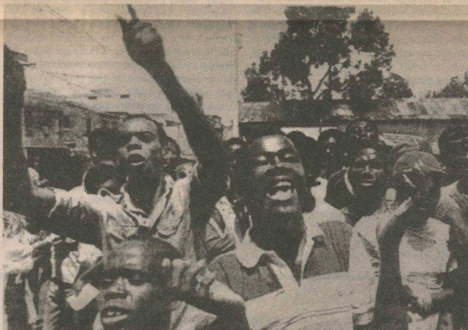
After having brought down the tyranny of Duvalier, today the Haitian masses are demanding the ouster of the military junta which was rigged up to block the revolutionary movement.

This year will also see a new mood among the workers of Haiti. The desperately poor toilers of Haiti have just emerged from under the shadow of 30 years of oppression