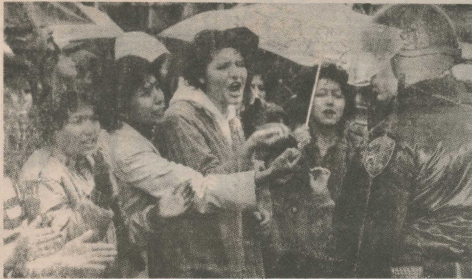
Striking cannery workers in Watsonville, California denounce the police sent in to suppress their struggle against concessions.

These weapons have been employed effectively in the past. One hundred years ago in the fight for the eight-hour day which grew into a general strike of hundreds of thousands of workers. Fifty years ago in the