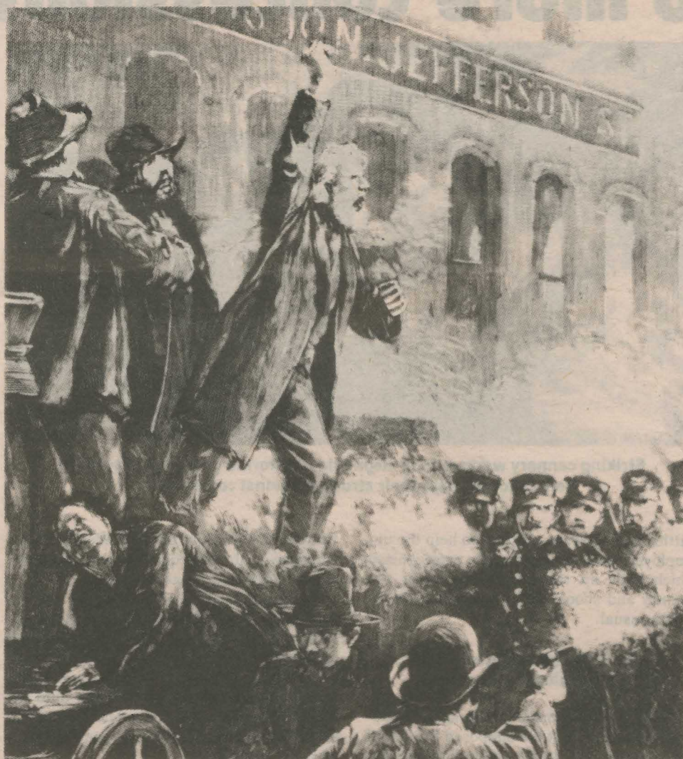
Graphic depicting clash between workers and police at Haymarket Square rally, May 4, 1886.

On May 3, six picketers at the McCormick Works in Chicago were gunned down by the police. The next day, a protest rally was called in Haymarket Square. A provocateur threw a bomb, and a struggle broke out leaving several workers and police dead. The capitalists cried for blood. Ten workers were