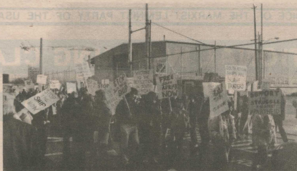
A scene from the militant anti-apartheid picket at the San Francisco docks on March 10. The protesters, with support from dockworkers, succeeded in preventing the unloading of South African cargo for a day and a half.

Botha promises to adjust the pass laws and other outrages of apartheid. He even