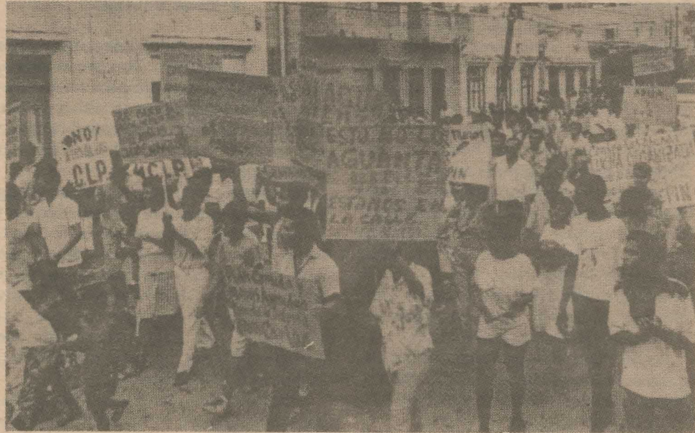
Hunger protest in Santo Domingo, July 9.

On July 9, hundreds of barrio residents joined together in a March of Empty Pots in Santo Domingo, the capital of the Dominican Republic. They protested the high cost of living and the disruption of water and electric services.