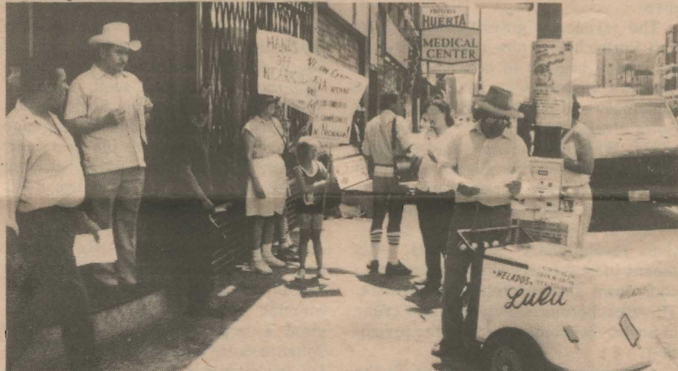
MLP, USA comrades take support for the Nicaraguan revolution to the sidewalks of Chicago to mark ninth anniversary of the people's triumph over dictator Somoza, July 19.

"We support the Marxist-Leninist Party of Nicaragua which is working hard to strengthen the workers' movement, to block the path to U.S. imperialist-sponsored reaction, and to open the way for a revolutionary power of the toilers." □