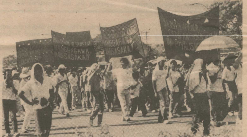
Revolutionary workers in May Day action in Manila.

At the May 1st rally, revolutionary activists also circulated leaflets calling for the establishment of an independent revolutionary movement of the proletariat. They agitated in favor of a movement that would not tail behind the Aquino government and the bourgeoisie and that would be free from the vacillations of petty-bourgeois revisionism — these are problems which have marked the politics of the CP of the Philippines and organizations associated with it such as the KMU. □