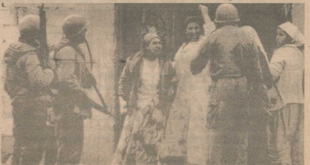
Palestinian women confront Israeli occupation troops.