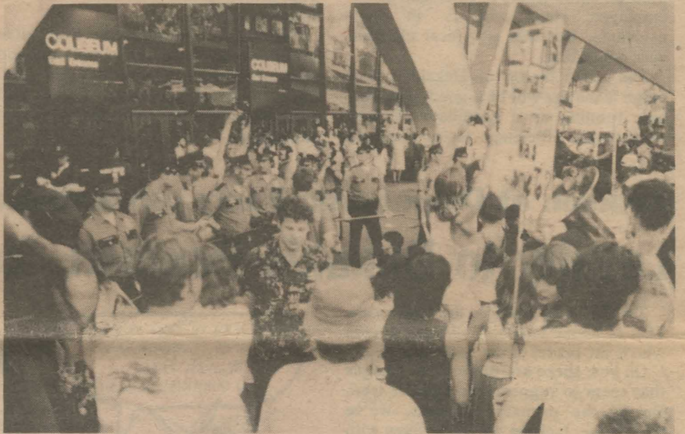
Ollie North, an organizer of the secret contra aid network, denounced in Seattle, July 20. See inside, page 6.

The Democrats are leaning toward more funding too, although they may insist on their own bill. After all, after