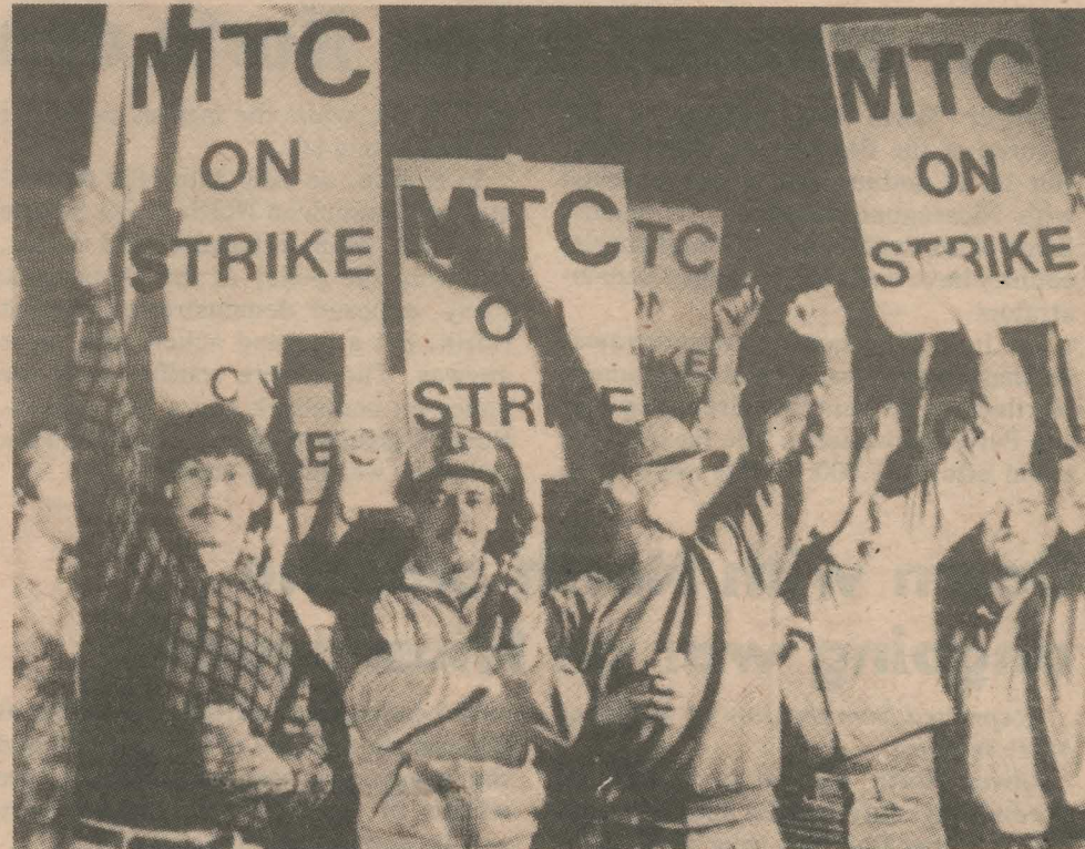
Picket line at General Dynamics' Electric Boat shipyard.

On July 25, about 800 shipyard strikers and their supporters rallied near the gate of General Dynamics' Electric Boat submarine yard in Groton, Connecticut. The workers wore T-shirts that read: "We're out the gate in '88!" And many carried picket signs declaring: "Dump the lump!"