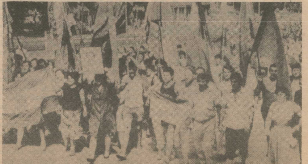
Rubber and shoe workers march on the parliament in revisionist Yugoslavia.

But the workers are not sitting still as the government traitors to communism tighten the noose around the people's necks. They are in a fighting mood. □