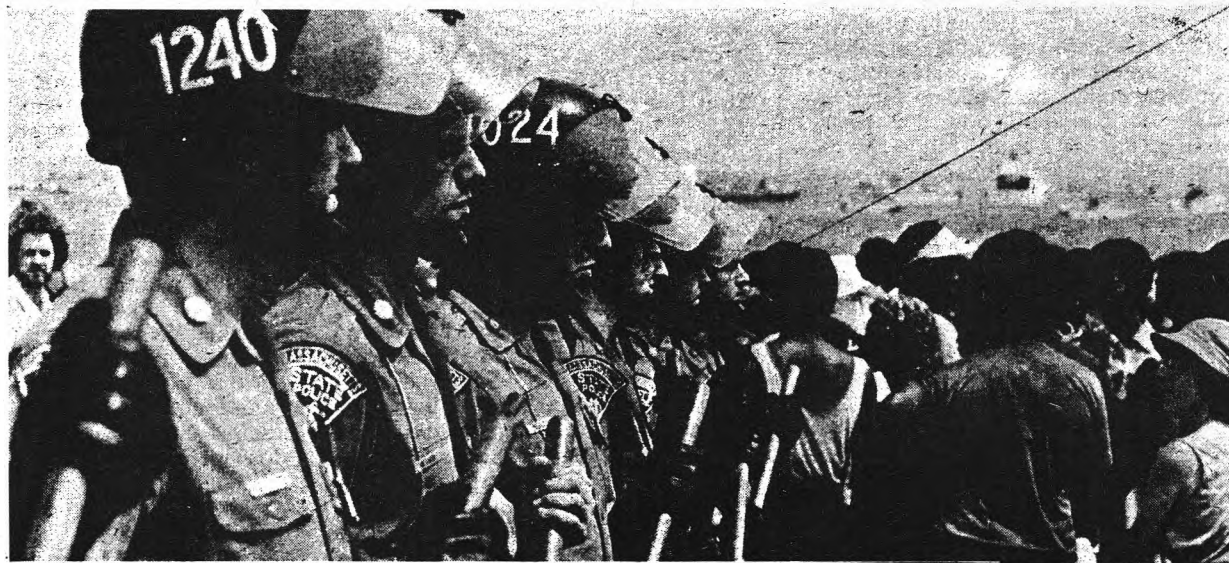
NAACP MISLEADS AFRO-AMERICAN PEOPLE UNARMED INTO POLICE TRAP AT CARSON BEACH LAST AUGUST. THE OL FELL RIGHT INTO LINE, AND EVEN AFTER THE POLICE BEATING PRINTED THIS PHOTO UNDER THE HEADLINE: "FREEDOM STRUGGLE ERUPTS IN BOSTON" ( THE CALL , 9/75). AS THEIR CATION SHOWS, THEY THINK IT WAS A GENUINE INTEGRATION STRUGGLE.

We should always use this practice of the OL's around concrete issues like the Shah and Puerto Rico to size up their promise of "full support to the peoples, nations and countries of the world who are rising up in opposition to imperialism".