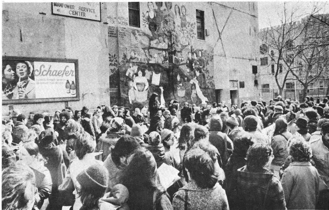
THE LOWER EAST SIDE CONTINGENT OF THE UNION SQUARE IWD RALLY IN N.Y., 1975. SPEAKERS FROM ORGANIZATIONS IN THIS CONTINGENT EXPOSED SOVIET SOCIAL-IMPERIALISM AND THE "C" PUSA, WORKING WITH THE MISLEADERS TO HANG THEM.

been going through in the past year. In the course of this flip, they've uncovered a whole series of right opportunist dangers in the movement that they hadn't noticed before. Just like the RU's proclamation of party building in the "brief period ahead", the OL has come up with a whole series of new justifications and sophistries to cover their latest maneuvers.