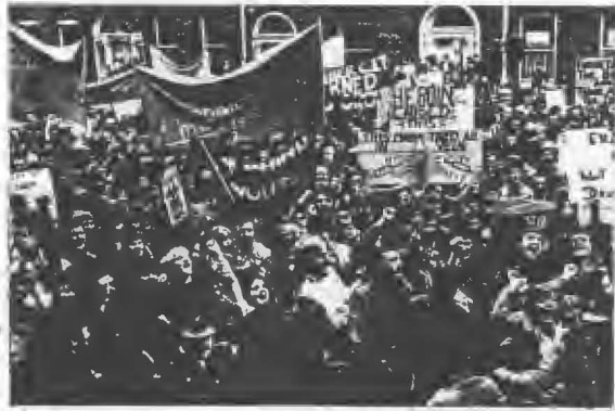
The Republican Movement campaigns on all economic and social issues that effect the working class. Their advice centres in working class areas have broad community support and have contributed to the political strength of Sinn Fein. The above photograph shows a demonstration against drugs in the south. The Republican movement has been active in the campaign which has also confronted state opposition.

The 'left' who call for socialism without nationalism in the context of an oppressed nation not only throw out the national struggle, but inevitably sabotage the class struggle. They end up doomed to isolation and defeat. Those who still cannot