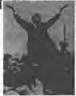
Larkin leader Jim Larkin

ABOVE: The proclamation of the Provisional Government of the Irish Republic in 1916. "We proclaim the right of the people of Ireland to the ownership of Ireland", it declares.