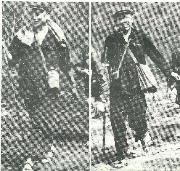
Pol Pot (left) and Ieng Sary lead the war of resistance from the Kampuchean countryside. Pilger claims that Pol Pot is in China

But now to the crunch. What would you do if you were part of the liberation forces entering Phnom Penh in April 1975? There is no food, no water, the sewers are overflowing and disease is spreading like wildfire. The countryside is lacking population; the farms bombed and isolated.