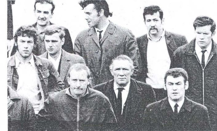
"This one I took with a 500mm lens from a derelict building near Unity Flats".

With that combination at work in the future, the "VOICE OF THE PEOPLE" to be made as the "IRISH LIBERATION PRESS" has always been made, that is literally on a kitchen table, will go from strength to strength and with it the struggle of the people against the exploitation of man by man.