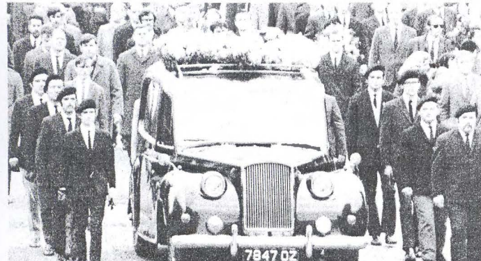
"If I remember correctly, this one I shot Intelligence that funerals were very

ANSWER: I'm not sure. I've tried to get work as a photographer, but things seem tight as far as jobs go. I've walked miles. I've been unemployed since I came out. Funny, most of the people in northern Ireland I was instructed to photograph were protesting about being unemployed. Now here I am in the same position as they are. No money, no job, and I can't see what future there is until things are changed completely. That's what attracts me to socialism.