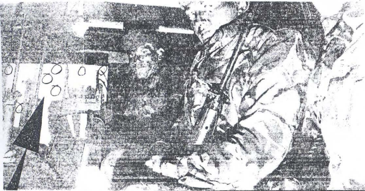
at inducing terror and the sheet of photographs of the "wanted" stuck to the inside panel of their vehicle. Here is the inside story of how these terrorists

One day Magilligan, and the rest of the camps in the north, will come in handy — for keeping venal like Faulkner under lock and key while the liberated people go about building a united socialist Ireland.