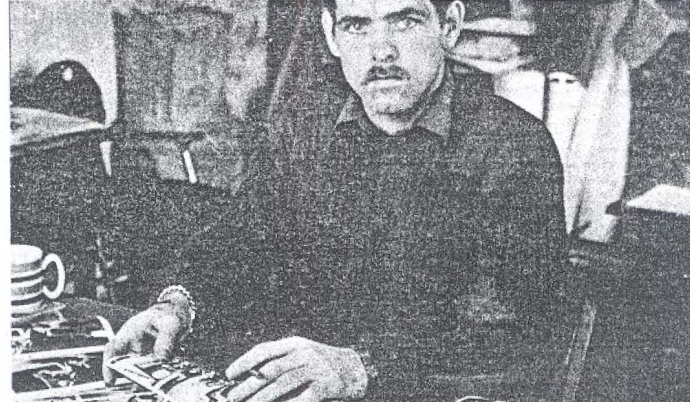
"This is one I took showing army Intelligence sifting through photographs in order to prepare "wanted" lists to be handed on to British army raiding squads."

Unionist Robin Chichester-Clark also supported Wilson's proposals. Thus Lynch and the