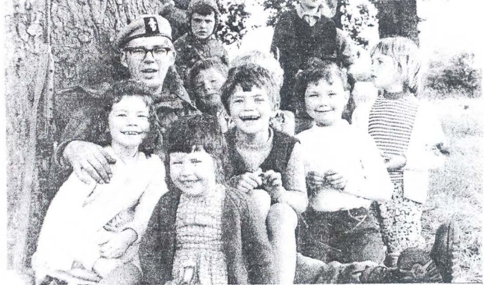
"I took this shot in Armagh in July 1970. It was a propaganda "set-up" for use in British papers and other reaction-