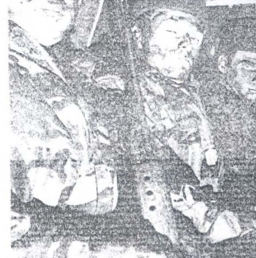
A British aggressor raiding party seated in the back of a lorry, prepares to set off in hunt of Irish men, women and child patriots. Note the darkened faces aimed

The reason so many children suffer such conditions is because of the pittance of a wage the breadwinners are paid by their bosses. The