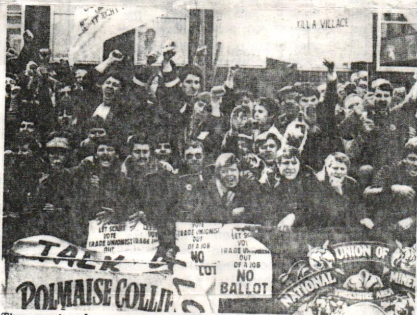
Thousands of miners demonstrated in Sheffield on April 12 in support of the continuation of the miners' strike.