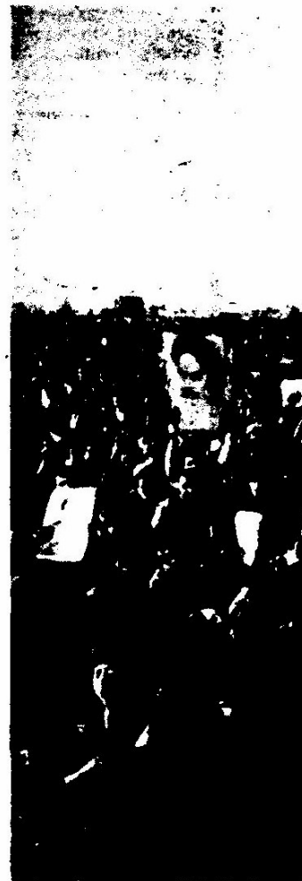
Mass welcome for the Ayatollah Khomeini.