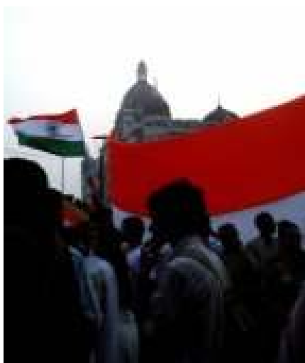
Peace March at the Gateway of India

The terrorist attack on Mumbai (Bombay) on the night of November 26-27 led to nearly 200 deaths and 300 wounded. The attention of the Indian and international media was above all concentrated on the two luxury hotels Taj Mahal and Oberoi, drawing an analogy with the “twin towers” of New York destroyed on September 11, 2001.