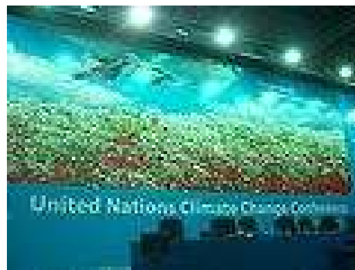
Plenary Hall stage of 2008 UN Climate Conference

Climate change is much more than one ecological problem among others: it is the chemically pure expression of the fact that the irrepressible capitalist logic of accumulation is leading humanity to destroy the environment in which civilizations have developed for six thousand years.