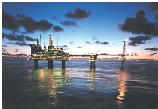
Natural gas produced in the Sleipner field is high in CO2. The operator of the Sleipner field, Statoil, geologically sequesters the CO2 because the cost is less than the Norwegian carbon emission tax.

The energy-climate question is one of those areas where the policy of Barack Obama could be most radically distinguished from that of George W. Bush. Under the leadership of the new president, in fact, the United States should quickly adopt an obligatory plan of reduction of greenhouse gases, invest massively in renewable energies and play an active role in the negotiation of a new international treaty to take over from Kyoto, in 2013. The turn is undeniable. We should take note of it, but we should also measure its limits... and dangers.