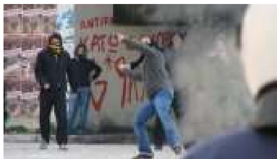
Riots in protests against the killing

Our answer will be to resist and to keep fighting to overthrow the policy of police oppression, austerity and racism