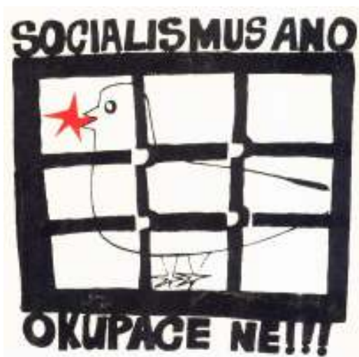
Socialism yes, occupation no

November 21 2008 marked the fortieth anniversary of the end of the student strike in Czechoslovakia against the occupation of the country by Russian troops the preceding August.