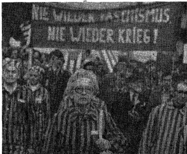
"Never again Fascism" "Never again war" read the signs at April 21 march in Cologne, Germany. Nazi concentration camp survivors in prison garb were joined by many West German soldiers in uniform—despite the fact that marching in uniform is illegal.

The French invasion of Zaire's Shaba province, May 19, by the infamous troopers of the Foreign Legion, is the latest escalation in that former colonial ruler's rapidly growing military