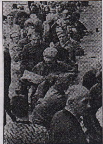
THE ETERNAL DOLE QUEUE

When staff went on strike for a week in Ealing Dole office in London, they were supported by