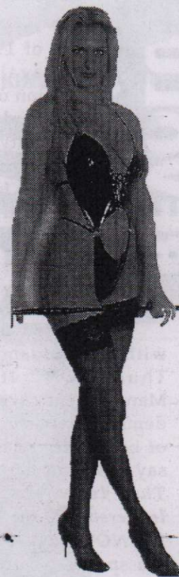
WHAT DOES THIS SAY ABOUT US?

asking Paul Condon to reform the police. Only women's action and workers control over the media will ensure that we have a real say in how our bodies should be seen.