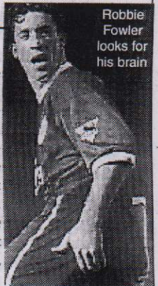
Robbie Fowler looks for his brain