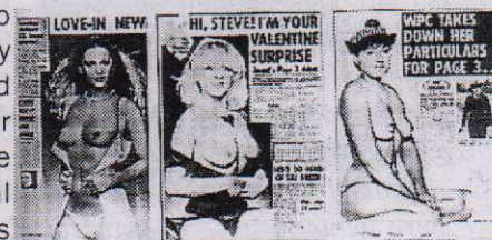
10 Million see this every day