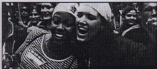
fighters not babes

images of women fill the pages of newspapers and the screens of TVs and