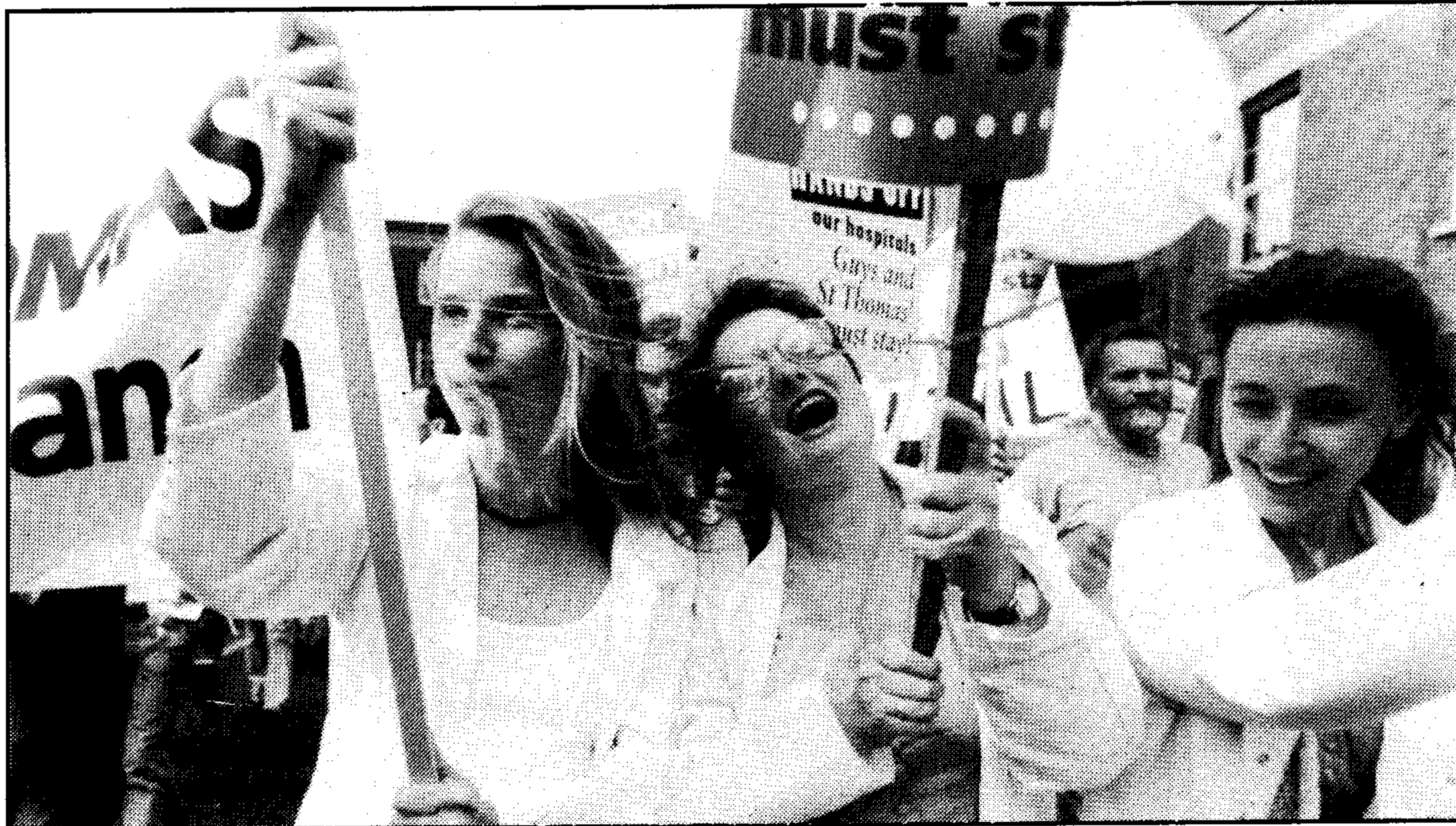
Welfare State Network must highlight needs of young people

At the same time, the Tories bring in league tables to set schools