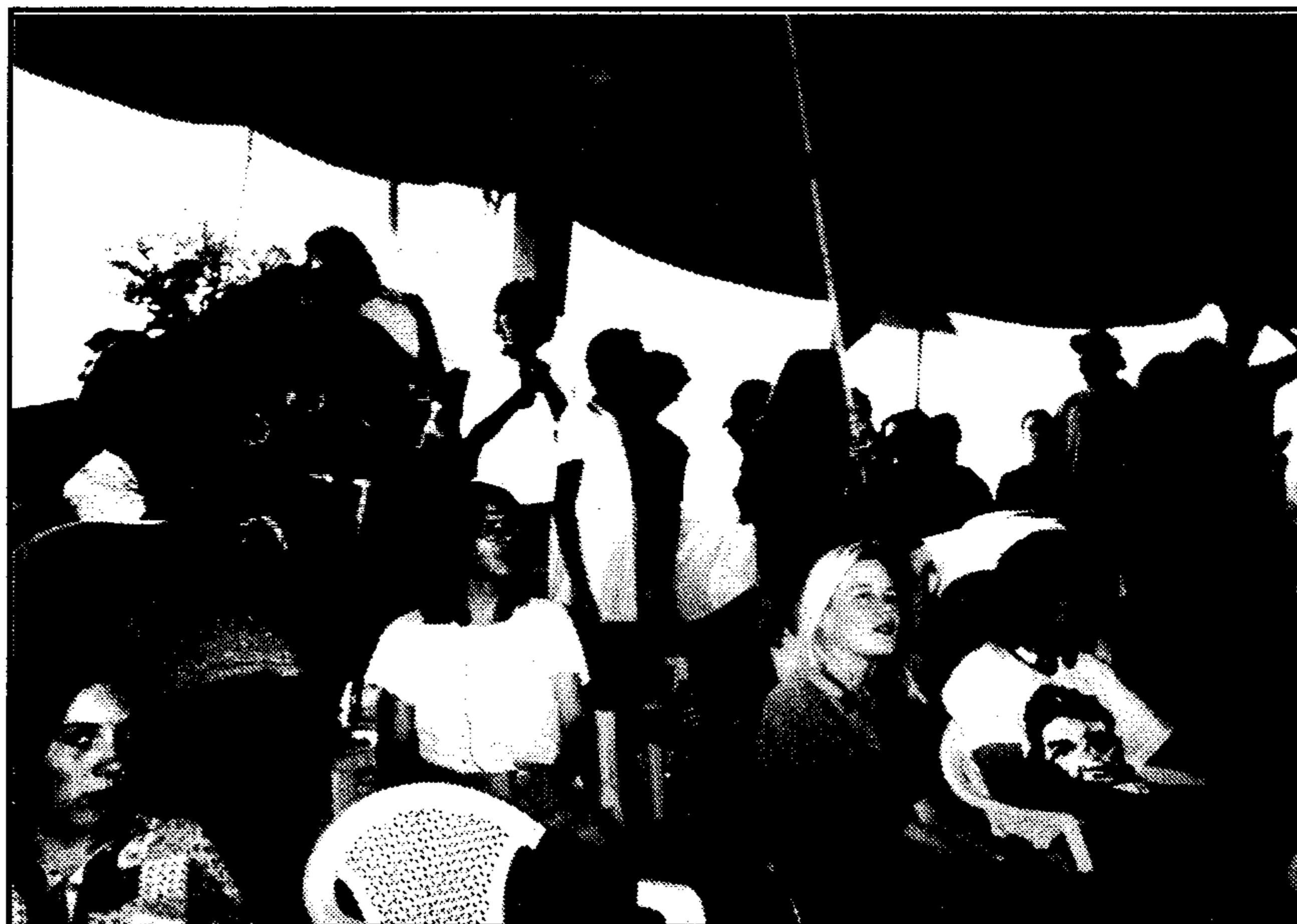
1,100 attended the feminist and revolutionary camp last year

All this for just £150 - It's an amazing deal. Last year, the camp in Tuscany was a massive success. Join the Liberation! delegation, put up the Liberation! poster and encourage your friends to join us too! Let's make the whole thing even more massive this time round.