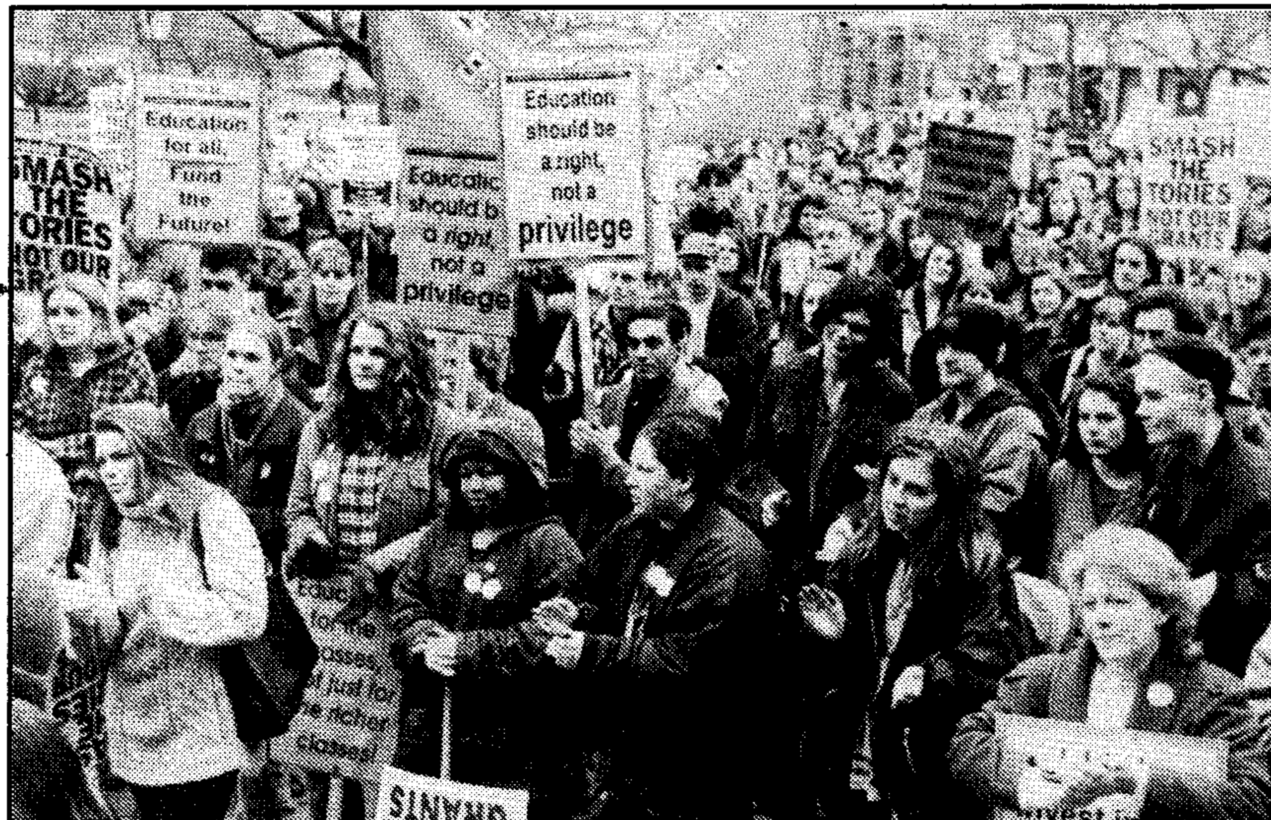
Leicester students spell it out - our education is a right!

All of this makes going to college less and less attractive. But it isn't a conspiracy to keep higher education for those with