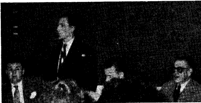
Litherland tenants' leaders address a crowded meeting

Litherland tenants have a right to ask that Labour should fight this lodger tax. Their local Labour Group is probably the only one in