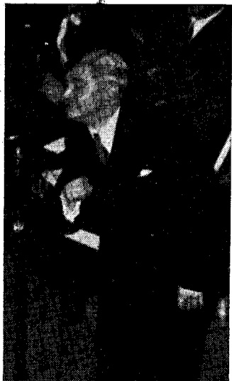
IN LIGHTER MOOD Nye Bevan cracks a joke at Churchill's expense

*"Facing the Facts", "Labour's Foreign Policy", and "Towards World Plenty".