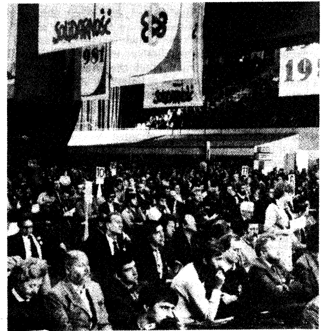
The 1981 Solidarnosc Congress

These 11 prominent leaders are but the tip of a very large iceberg. Many others have already been tried and sentenced. Focusing protests on these