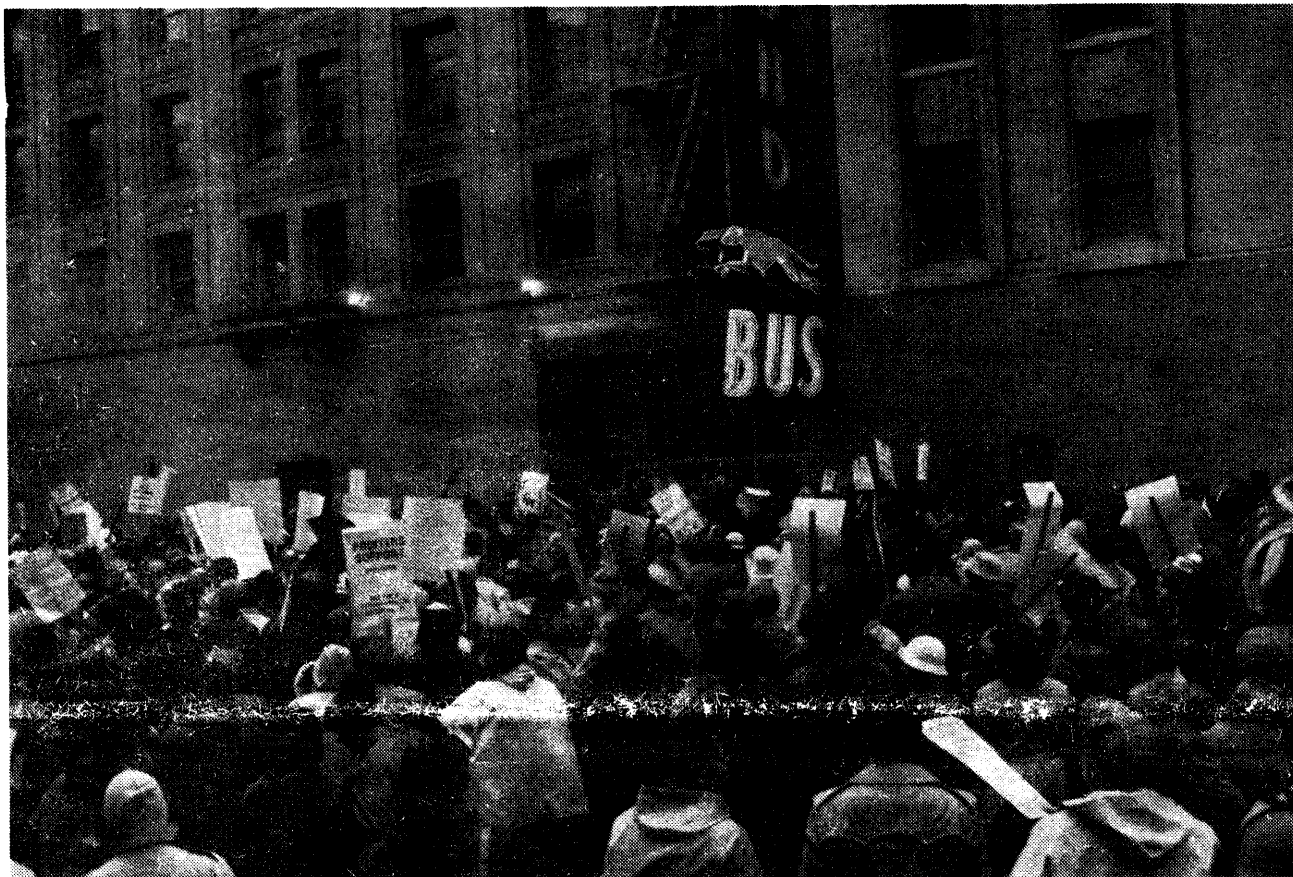
Two thousand strike supporters shut down Greyhound in San Francisco Saturday, December 3. (See story page 10)