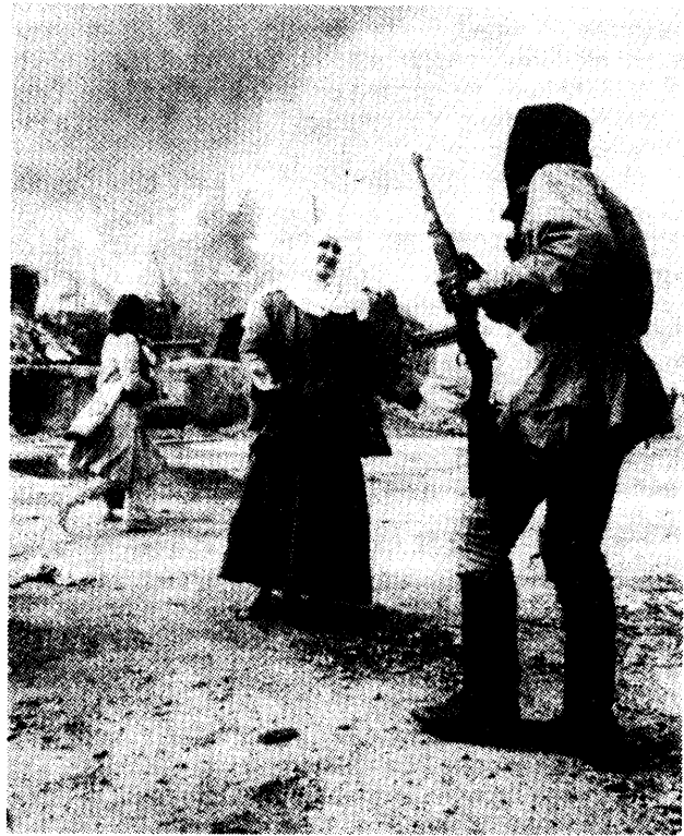
Phalange soldier threatens Palestinian woman in Lebanon.