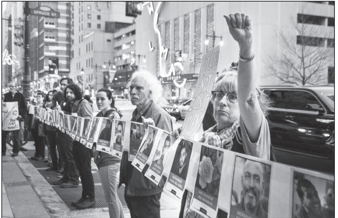
(Left) Palestine solidarity activists picket the Philadelphia Orchestra, protesting its June 2018 tour to Israel.

Marxists are clear that such hatred is not welcome