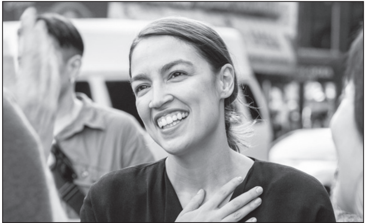
(Above) Alexandria Ocasio-Cortez, a member of Democratic Socialists of America from the Bronx, won a House seat on the Democratic Party ticket.

The main issue that the Democrats ran on was simply "stop Trump." CNN and AP VoteCast polls on the eve of the election both showed that close to 70% of