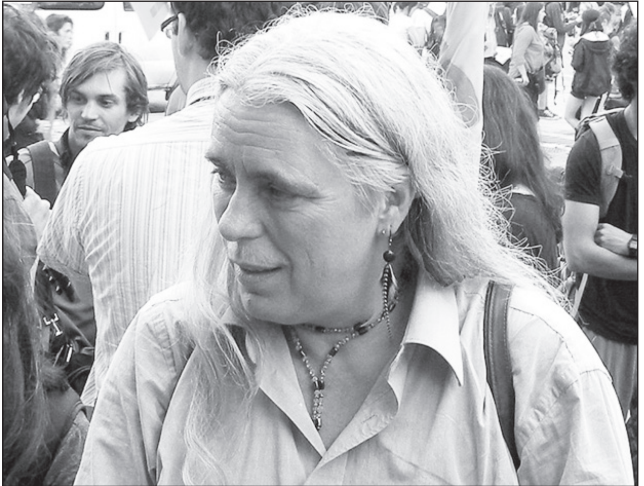
(Above) Québec Solidaire leader Manon Massé.

The bureaucratic leadership of the unions is quite disoriented by this turn in Quebec politics. Its de facto alliance with the PQ is sinking. Yet it hesitates to support and intervene in QS. It has not mobilized the