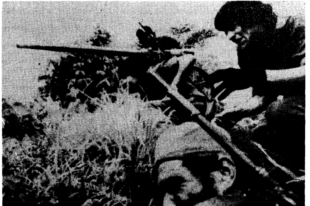
Sandinista fighters finish off Somoza's national guard