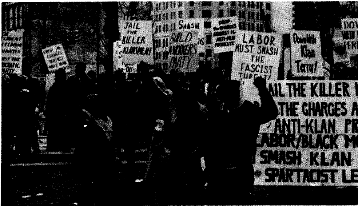
left: Car workers rally against KKK above right: Massive leafletting mobilised for the protest

On November 3, to the horror of more than 100 onlookers, the Ku Klux Klan stormed an anti-Klan rally in Greensboro, North Carolina in the US South with guns blazing, murdering five demonstrators and wounding many others. The victims were longtime civil rights activists and union organisers, and they called themselves communists, members of a tiny Maoist group known as the Workers Viewpoint Organisation. The capitalist press and capitalist politicians unanimously termed it a 'Klan-leftist shootout', though not a single KKKer was even scratched. Then they claimed that the anti-Klan demonstrators fired first. But the millions who saw the news footage on television knew it to be a lie of grotesque proportions.