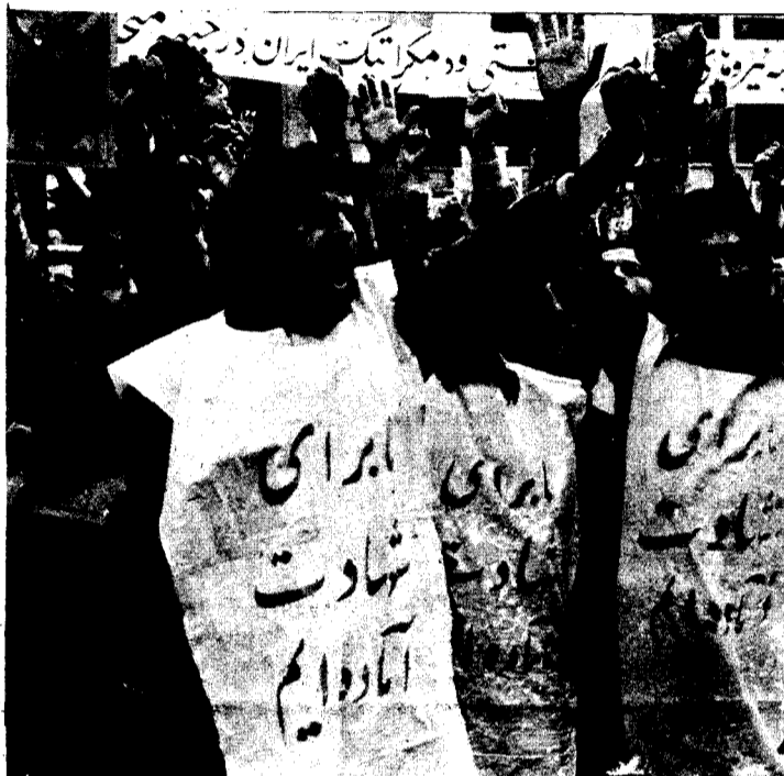
Two faces of the Iran crisis: clerical fanatics declare: 'We are ready for martyrdom'; jingo frenzy in the US

With every passing week the confrontation has deepened. Khomeini has called for a jihād (holy war) by the entire Muslim world against the US and urged Iran's 20 million youth to take up arms to 'serve Islam'. He has charged that the Tehran embassy was a 'nest of spies' and threatened to have the hostages tried before his 'revolutionary tribunals'. This accusation predictably elicited no comment from the State Department and the White House -- and for good reason. Under the shah, the US embassy was notorious as a branch office of the CIA, a coequal and sometimes predominant seat of power with the Niavarán Palace. High CIA officials, including Richard Helms and William Sullivan, were posted to Tehran as US ambassadors. We shed no tears for the imperialist