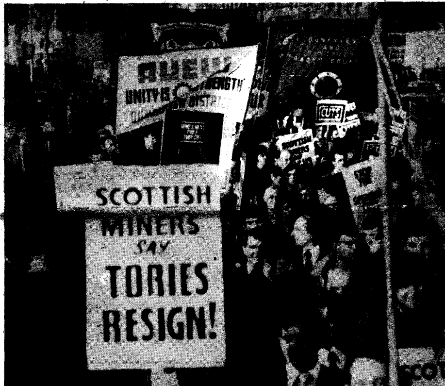
Trade unionists march in London on anti-cuts Day of Action, November 28