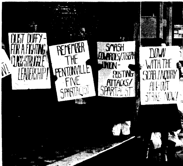
Spartacists at lobby of the AUEW 'inquiry'

Workers at Longbridge set the example -- they downed tools as soon as Robinson was dismissed on November 19. They were followed by workers at Canley, at Cowley, at Jaguars,