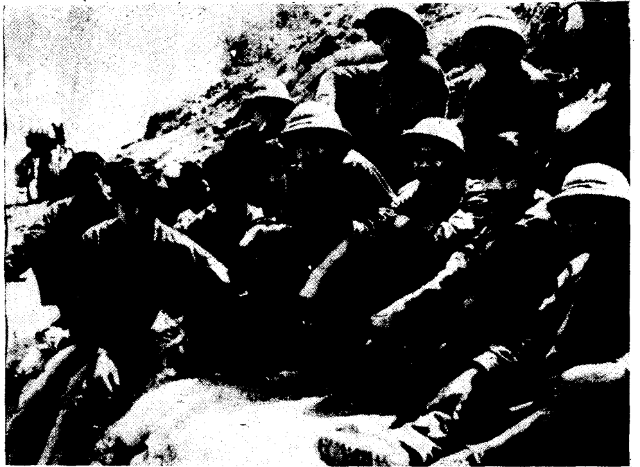
Vietnamese troops during the February 1979 Chinese invasion which consummated anti-Soviet US/China alliance. Since then imperialist propaganda war continued: first the 'boat people', now starvation in Cambodia

Against this background, Jimmy Carter's call for prayers for the Cambodians, and statements that the 'aid' issue is 'beyond politics ... a matter of simple and humanitarian concern' coming from White House officials ring hollow