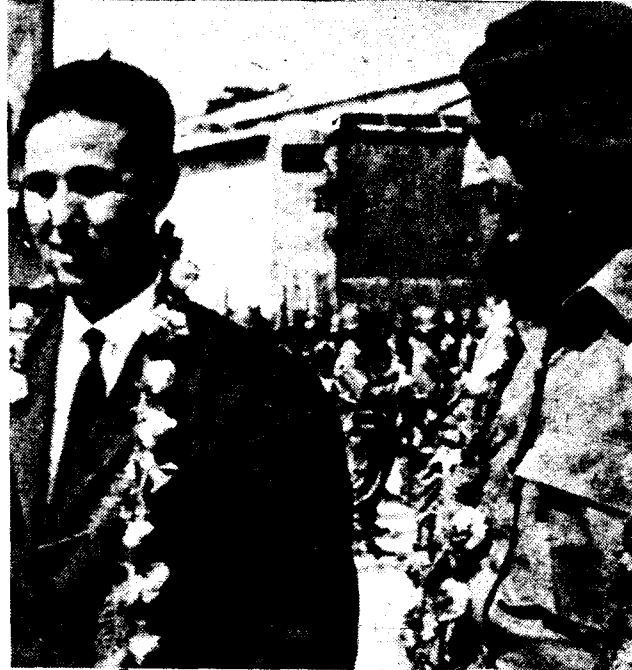
USec heroes past and present: Algeria's Ben Bella and Cuba's Fidel Castro

We can do more than pray. Over the years serious leftist USec supporters who sought an