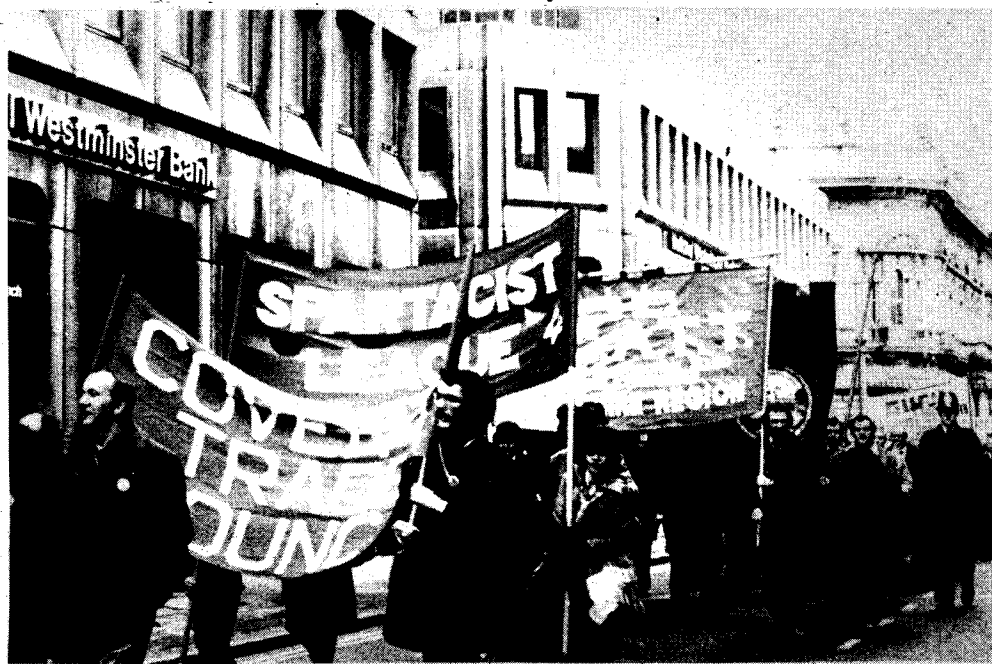
Spartacist contingent on Birmingham Day of Action, November 26

government bail-outs and lame-duck nationalisations. Nor is the decrepit British economy at all capable of reabsorbing the hundreds of thousands of workers who in any case would be without jobs if Leyland went under. BL workers must fight management's attacks and defend their jobs; but the stark truth is that there is no short-term 'solution' to the problem of Leyland -- it is the problem of British capitalism. If communists do not provide a revolutionary answer, then the fascists will be ready in the wings to step in and provide a totalitarian and genocidal one.