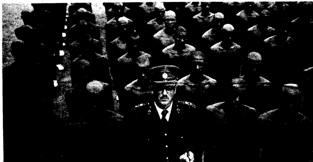
Black fodder for white supremacy: new recruits for Rhodesian police

No imperialist troops -- No deals with Smith, Walls and their black frontmen! White supremacy in Rhodesia must be smashed! But only a Trotskyist vanguard party, committed to the programme of permanent revolution, can lead the toiling masses in the struggle to regain their birthright through socialist revolution in Zimbabwe and throughout southern Africa. ■