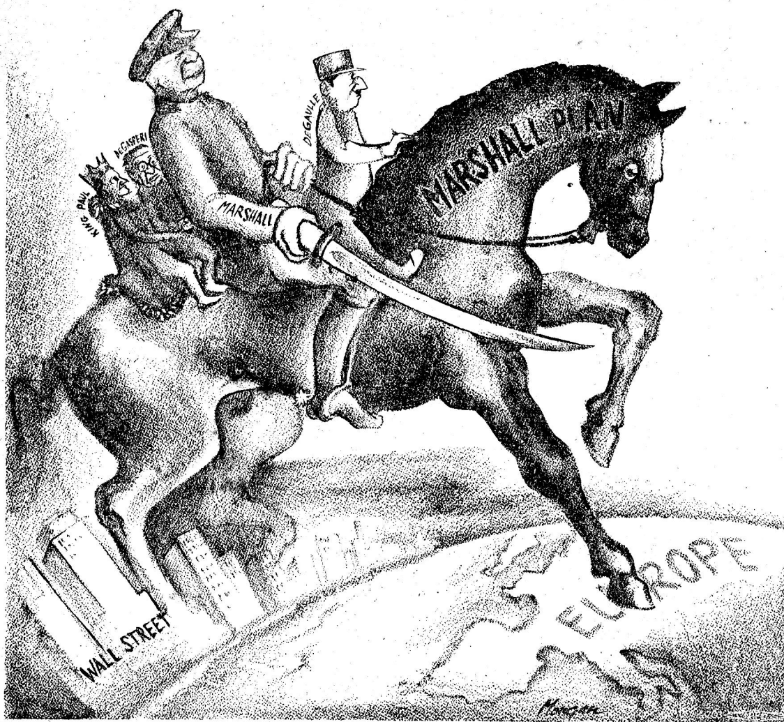
The Men on Horseback

Stalinophobia and UAW Convention See Page 2