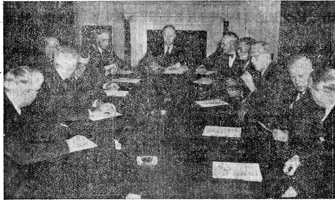
Senator Robert A. Taft (center of table) confers with top GOP Congressional leaders on ways and means to blame Democrats for high prices, while Truman and Democrats hold similar sessions to figure how to blame Republicans. Neither party offers an effective program, both are using the issue as a political football.