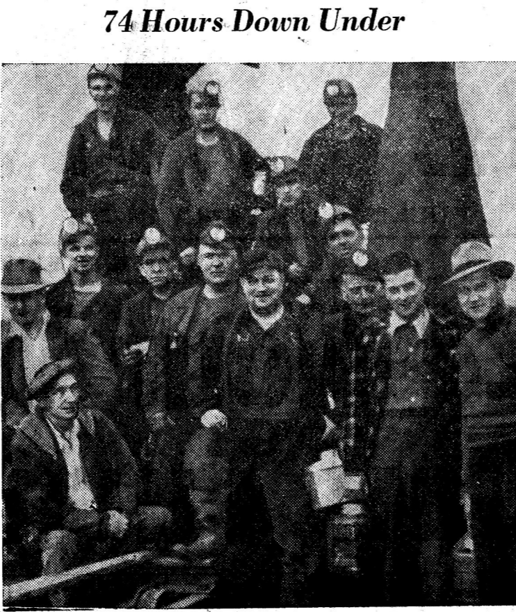
Strikers shown with some of the local leaders of the United Mine Workers after ending a 74-hour sitdown in a mine at Lansford, Pa. Ten men struck when their pay was docked for alleged early quitting. They came to the surface only after assurances that a hearing of the dispute would be held in Washington.