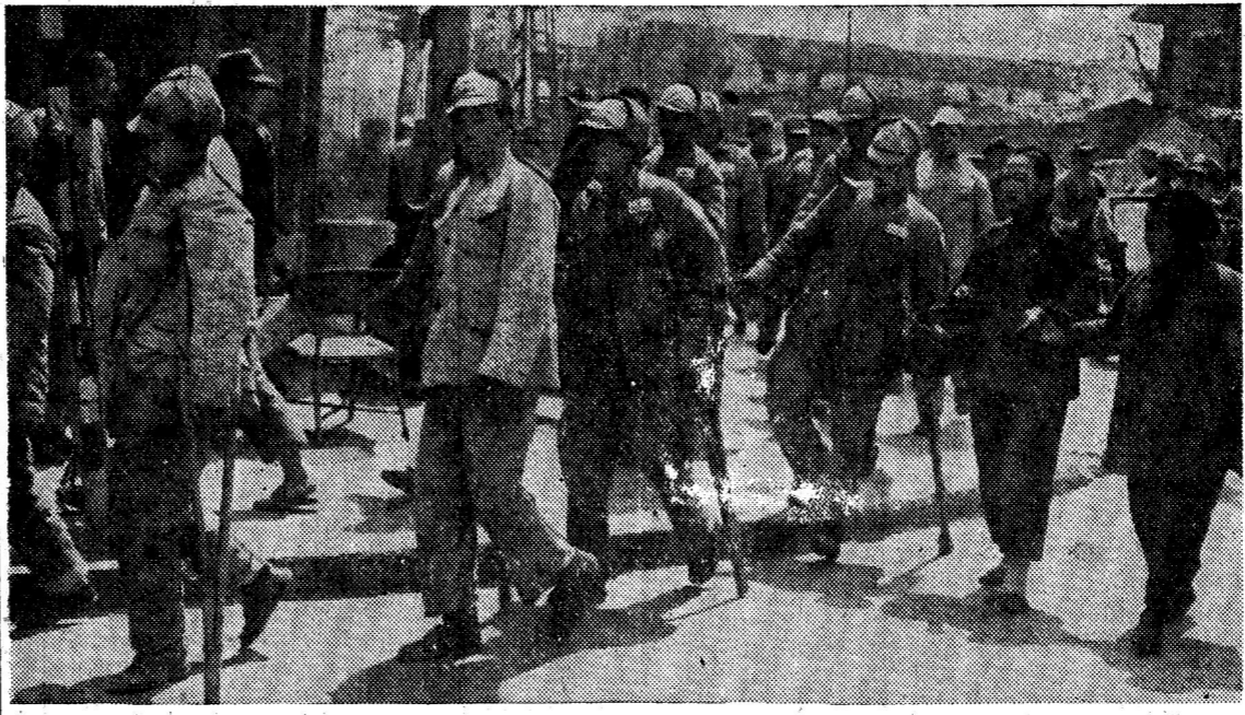
Wounded soldiers of the Nationalist army (top) pass through Nanking as Stalinist-led troops entered the city from the north and then swept on toward Shanghai. There was no resistance to the occupation of Nanking, former capital of the Nationalist forces.