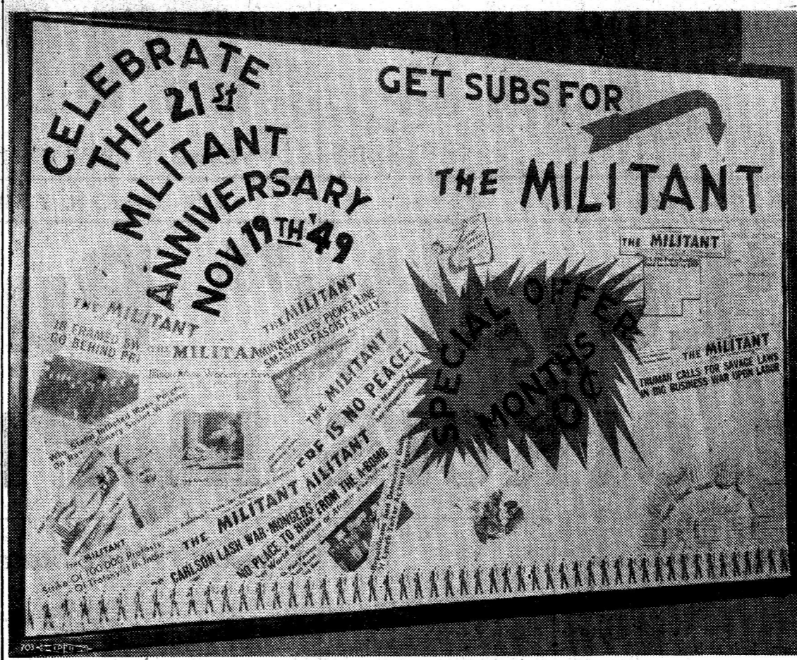
When the Minneapolis Branch of the Socialist Workers Party organizes a campaign, the comrades set out to do it right. The picture shows the large bulletin board in the Minneapolis headquarters at 10 South 4th Street decorated during the recently concluded national subscription drive for The Militant . The campaign was a success, Minneapolis scoring 227% of its quota and together with the live-wire St. Paul branch accounting for 264 points, the highest in the country.