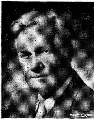
JAMES P. CANNON