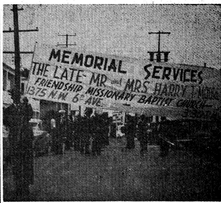
Historic Miami parade, in which hundreds of Negroes and whites marched through the city in a National Association for Advancement of Colored People memorial to Mr. and Mrs. Harry T. Moore, NAACP director in Florida, and his wife, were killed by a terrorist bomb in their Mims home.