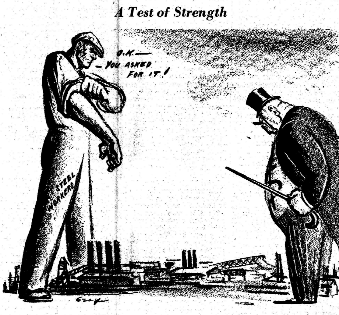
A Test of Strength

Typical of 1951 oil profits are Standard Oil of New Jersey's $528,461,000, largest for any company in the world.