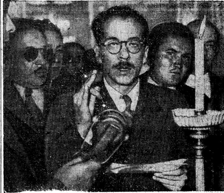
Members of the new Bolivian cabinet are sworn into office by Herman Siles Zuazo, vice president in the MNR government.

Armed, the masses responded heroically, and defeated the army after three days of hard fighting. As reported by our Bolivian correspondent in last week's Militant, the Revolutionary Workers Party (POR), section of the Fourth International, participated in the fighting and urged the masses to join it and raise their independent class demands. Siles