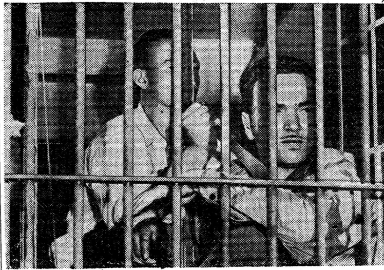
One of the hostages held by rebellious convicts at Jackson Prison in southern Michigan, a guard sits at window of cell block while prisoner holds knife at his throat for benefit of photographers. No guards were hurt, but one prisoner was killed and others wounded when prison guards fired at prisoners. This demonstration, like previous ones in New Jersey, succeeded in calling public attention to brutal conditions in the prisons.