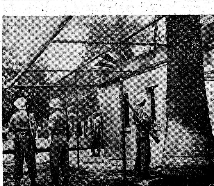
Scenes of French auto workers battling police in strike last year (top left), British troops patrolling during uprising in Egypt (lower left) and Japanese strikers wearing gas masks during demonstrations (right): — "And now that America has become the master of the capitalist world, her foundations are extended over all these volcanoes exploding or about to explode in all parts of what is left of the capitalist world."