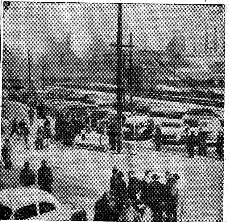
The giant Inland Steel Co. mill at Indiana Harbor, Ind., is shut down by strike of Local 1010, CIO United Steelworkers. The 18,000 workers walked out to protest suspension of three co-workers and company's new get-tough-with-the-union policy.